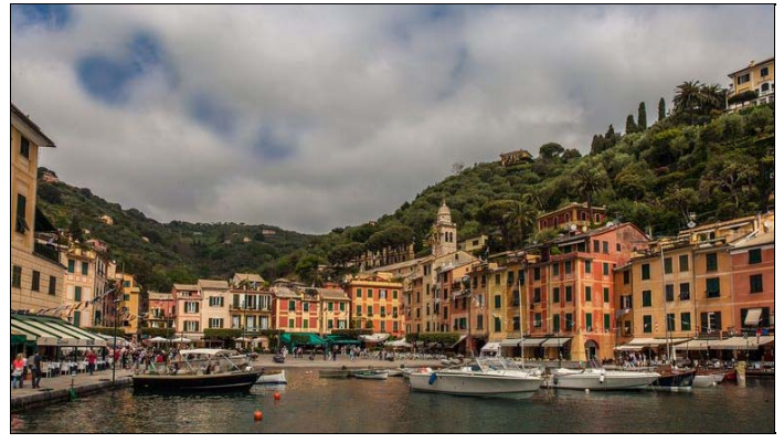
The harbor in Portofino, Italy, is one of the most photographed in the world.

PORTOFERRAIO, Italy — When you sail on a ship like the 208passenger Star Breeze, a vessel nimble enough to squeeze up to almost any tiny cove or narrow gorge, it's a good idea to bone up on the ports-of-call in advance.