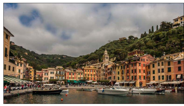
The harbor in Portofino, Italy, is one of the most photographed in the world.

PORTOFERRAIO, Italy — When you sail on a ship like the 208passenger Star Breeze, a vessel nimble enough to squeeze up to almost any tiny cove or narrow gorge, it's a good idea to bone up on the ports-of-call in advance.