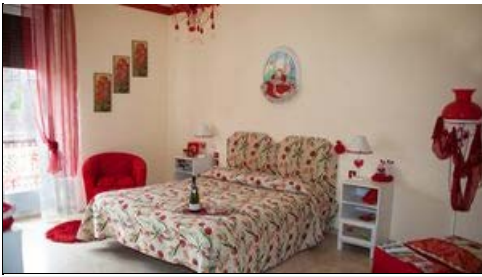
Guests staying the “ruby”room at the Bijoux di Penelope B&B can walk to Bologna’s historic center in ten minutes.

booked rooms in a better hotel with bell boys to tote the luggage, daily maid service and a restaurant and bar. But in today’s Internet-connected world, nothing says “tourism is king” like the myriad lodging options that have been revolutionizing where we go and with whom