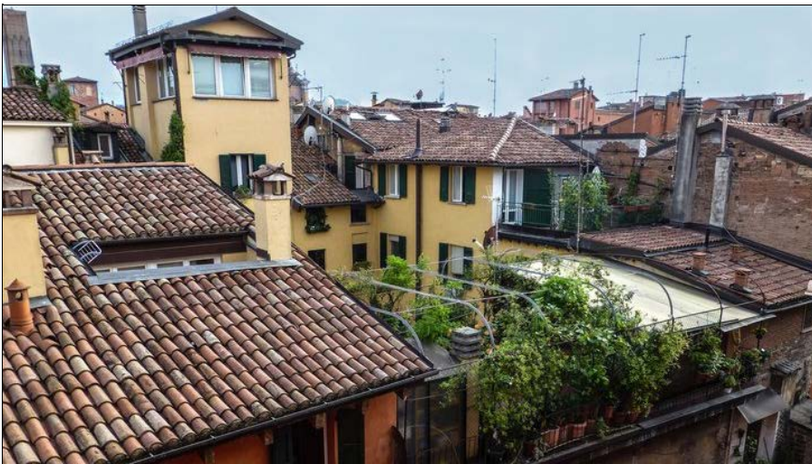
Balcony view of neighborhood rooftop gardens from the Ruby Room at the Bijoux di Penelope B&B in Bologna, Italy.

It all began with B&Bs, the 20th century version of the long-ago wayside inn, where travelers stabled their horses — or their camels — and shared a bed with a stranger. Contemporary B&B owners, who did the same thing but in style, made it acceptable to rent a room from a perfect stranger.