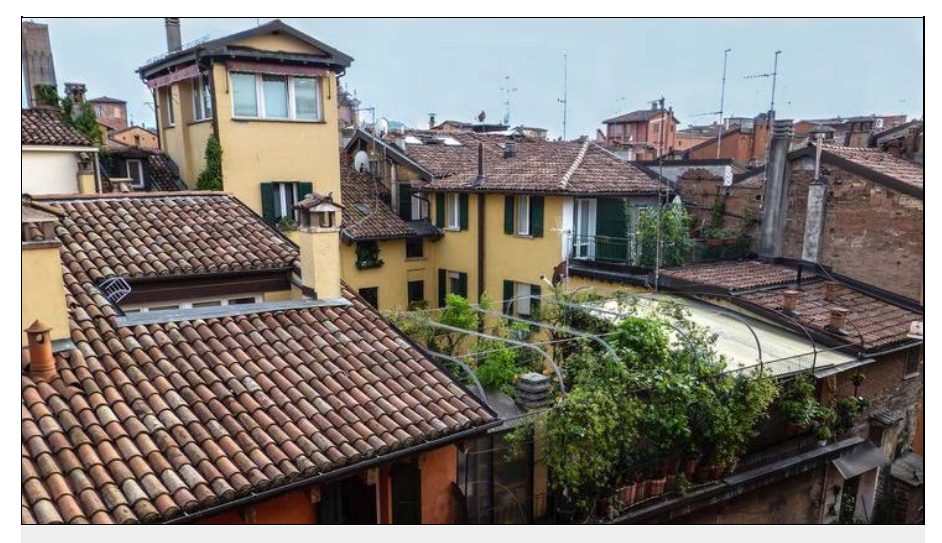
Balcony view of neighborhood rooftop gardens from the Ruby Room at the Bijoux di Penelope B&B in Bologna, Italy.

It all began with B&Bs, the 20th century version of the long-ago wayside inn, where travelers stabled their horses - or their camels - and shared a bed with a stranger. Contemporary B&B owners, who did the same thing but in style, made it acceptable to rent a room from a perfect stranger.