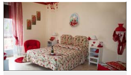
Guests staying the "ruby"room at the Bijoux di Penelope B&B can walk to Bologna's historic center in ten minutes.

Bed-and-breakfast, Italian style | www.myajc.com