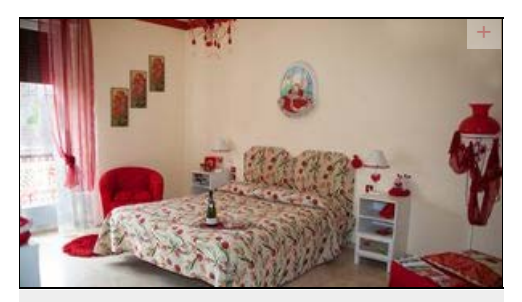
Guests staying the "ruby" room at the Bijoux di Penelope B&B can walk to Bologna's historic center in ten minutes.

Back in the day, travelers who could afford tours of Europe's historic cities booked rooms in a better hotel with bell boys to tote the luggage, daily maid service and a restaurant and bar. But in today's Internet-connected world, nothing says "tourism is king" like the myriad lodging options that have been revolutionizing where we go and with whom