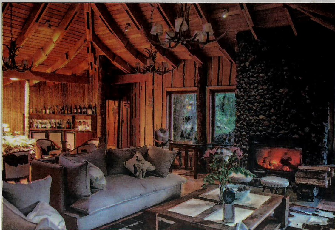
The appointments of a room at Nawelpi Lodge in Huilo Huilo are sumptuous. The hotel is also known for fine dining. There are many distinctive and luxurious hotels to choose from.