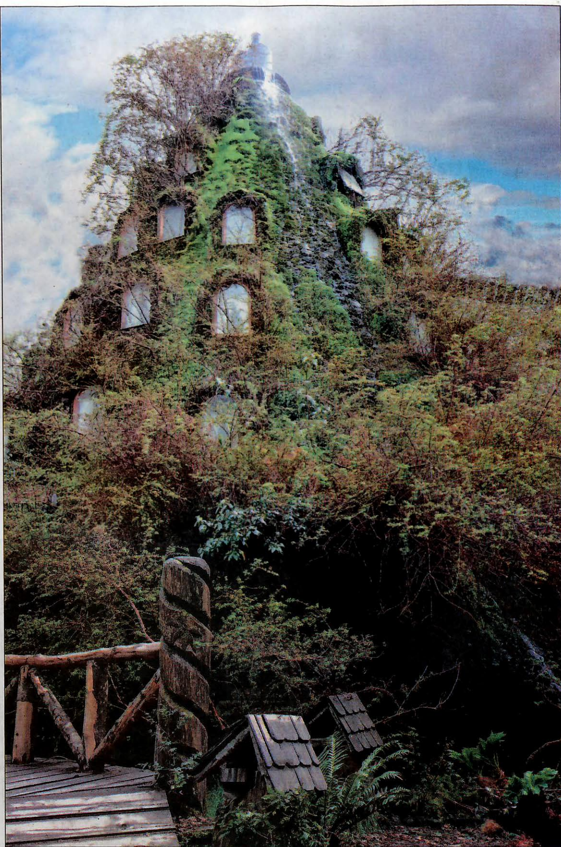
The Montana Magica hotel — the Magic Mountain — is made almost entirely of custom-hewn local wood, with giant logs, thick beams, and untrimmed board paneling.

By the time we stopped to watch an Andean condor overhead and admired the pre-European Mapuche artifacts in the nearly finished Volcano Muse-