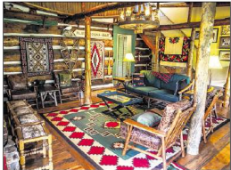
An eye for authenticity decorated the lodge with furnishings guaranteed to wet the whistle of any western art collector.

Seven small log cabins, each different and sleeping two to eight guests, have also been updated, with new chinking and insulation. The door frames are