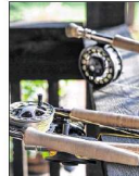
Don't bring your fishing gear. Rods, reels and waders are available to use, at no charge.

old, the doors and screens are new. The rooms were small, the new rooms have been rearranged to add more space. Upgraded lighting, comfy sofas and chairs and framed 1950s magazine ads, promoting rods and reels, continue the theme. Some cabins have private baths; three of the smallest — like so many 1950s and '60s wilderness camps — share a single bath house. As for the wood frame screen door on my cabin, it swung shut with a comfortable "thunk."