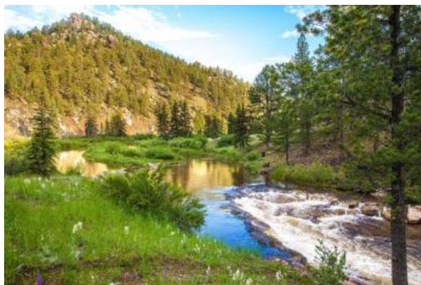
The Tarryall River, flowing through grassy meadows south to low hills and rock formations, meets the South Platte River north of Lake George.