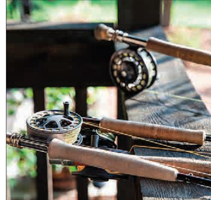
Don't bring your fishing gear. Rods, reels and waders from Patagonia, CF Burkheimer, Echo, Hatch and Spey Co, are available to use, at no charge