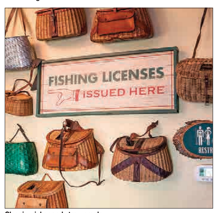
Classic wicker and straw creels help keep caught fish aerated.