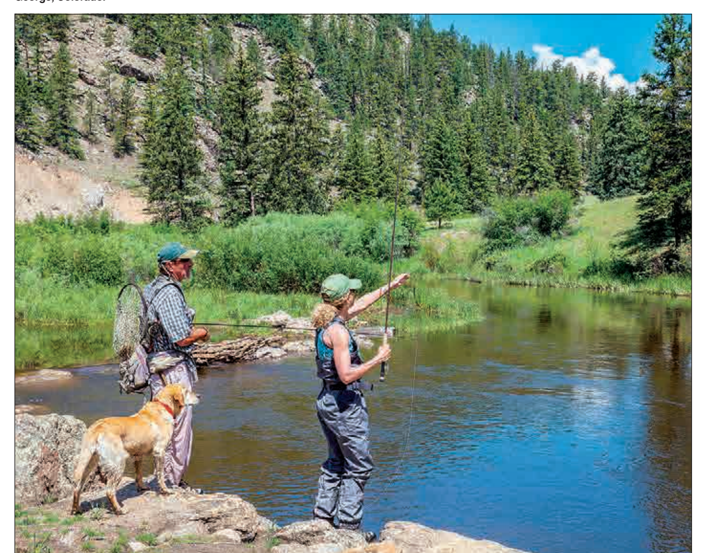
Pools and rapids on the 40-mile-long Tarryall River offer a variety of fishing adventures.