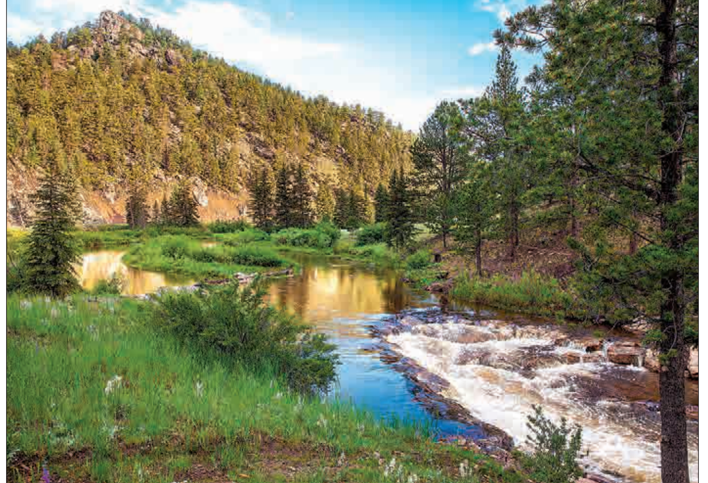
The Tarryall River, flowing through grassy meadows south to low hills and rock formations, meets the South Platte River north of Lake George, Colorado