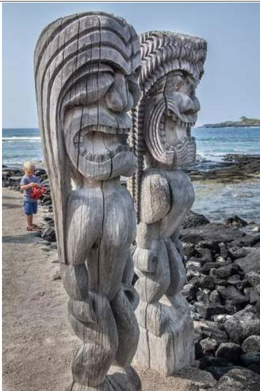
Wooden ki'i (carvings) stand guard facing the ocean at Pu'uhonua O Honaunau National Historic Park (the City of Refuge), South Kona, Big Island, Hawaii.