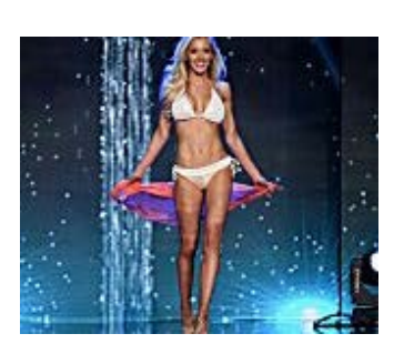
Miss Teen USA nixes swimsuit portion of