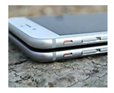
Forget The iPhone 7. Next Apple Sensation Leaked