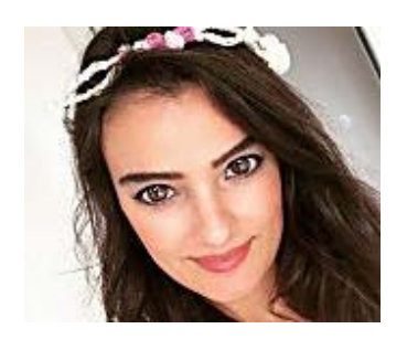
sentenced to 14 months