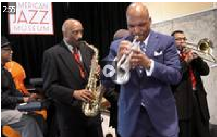
Live jazz has landed at KCI