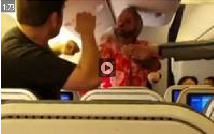
American passenger arrested after fight on flight from Japan