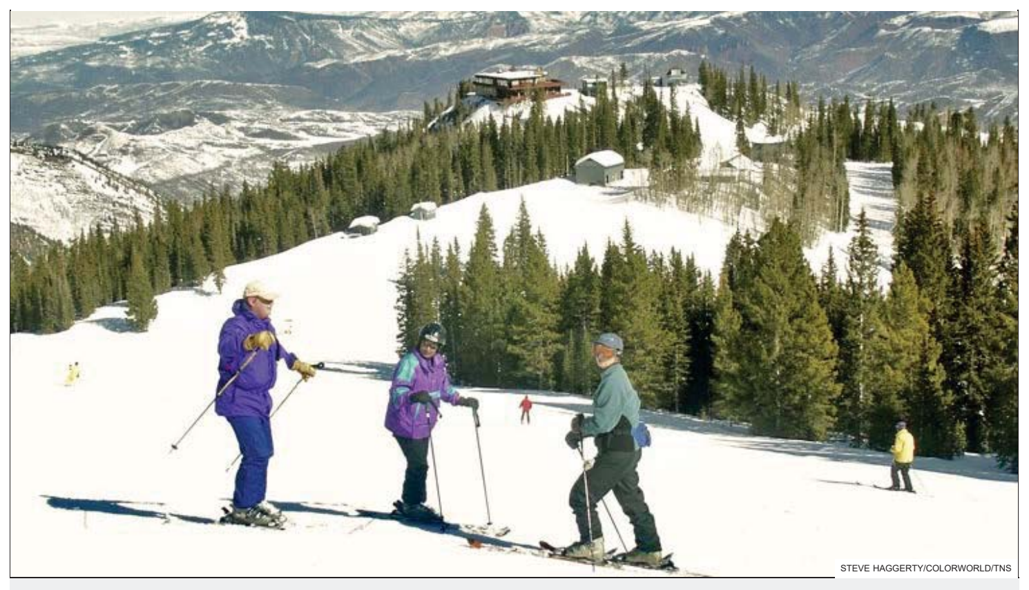
Skiing down Sneaky's run, with Sam's Knob restaurant in the background.

Posted: 6:00 a.m. Tuesday, October 24, 2017