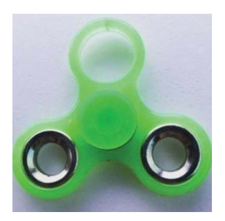
Fidget Spinner Scare, What You Need to Look Out For