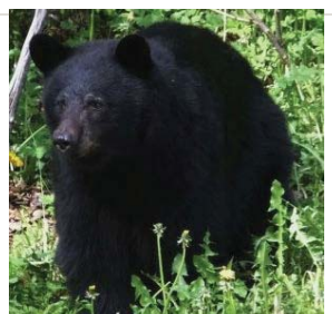
Alaska Bear Kills Teen During Race