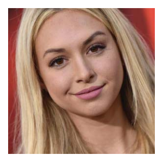
'Bachelor' Contestant Was Reportedly 'Limp and Unconscious'