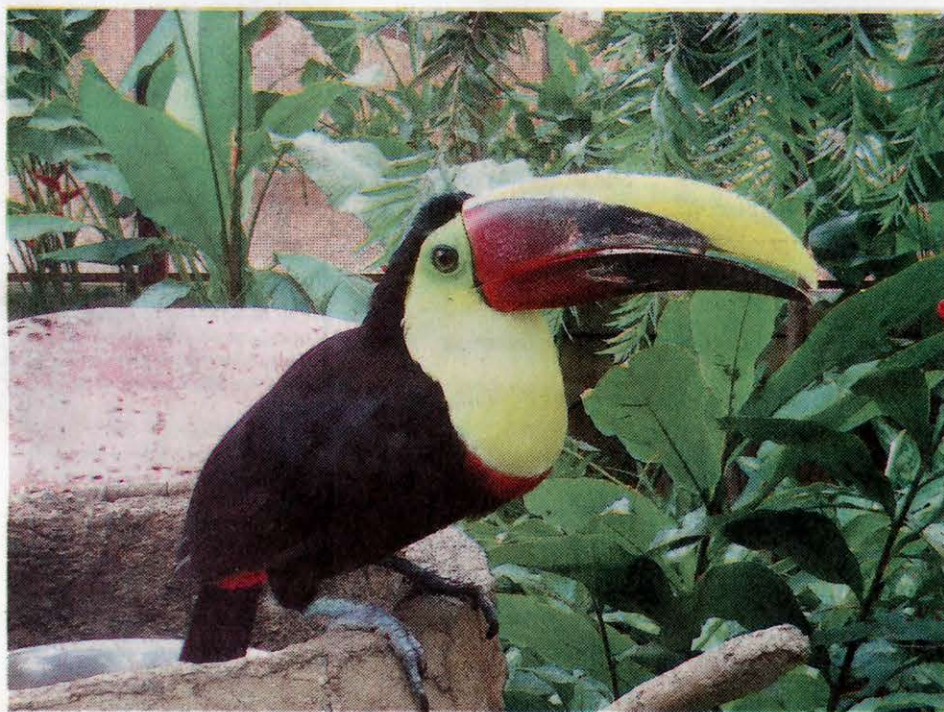
Keel-billed toucans, bright-colored and slow-flying, are easy to spot in dense rain forests like those in the Pacuare River gorge region of the Central American country.