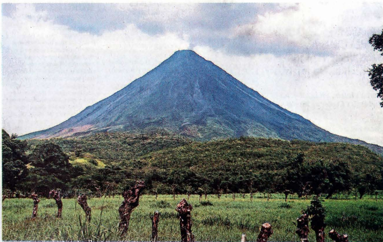
Arenal Volcano's 2010 eruption reminded observers that Central Costa Rica's famous feature can be unpredictable.