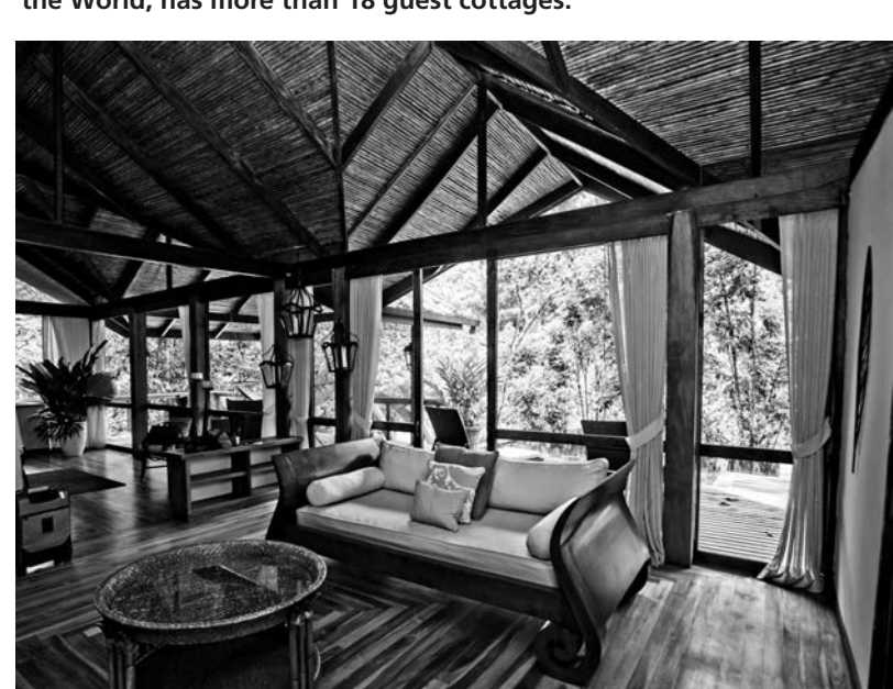
Staving in the Linda Vista Suites, high up in the rainforest canopy and with screened walls on three sides, feels like being outdoors.

topic turned to Costa Rica's many species, and how they have adapted to the country's 12 climate zones, each at a different altitude, from sea level to the summit of frosty, 3,820-metre Cerro Chirripo Volcano.