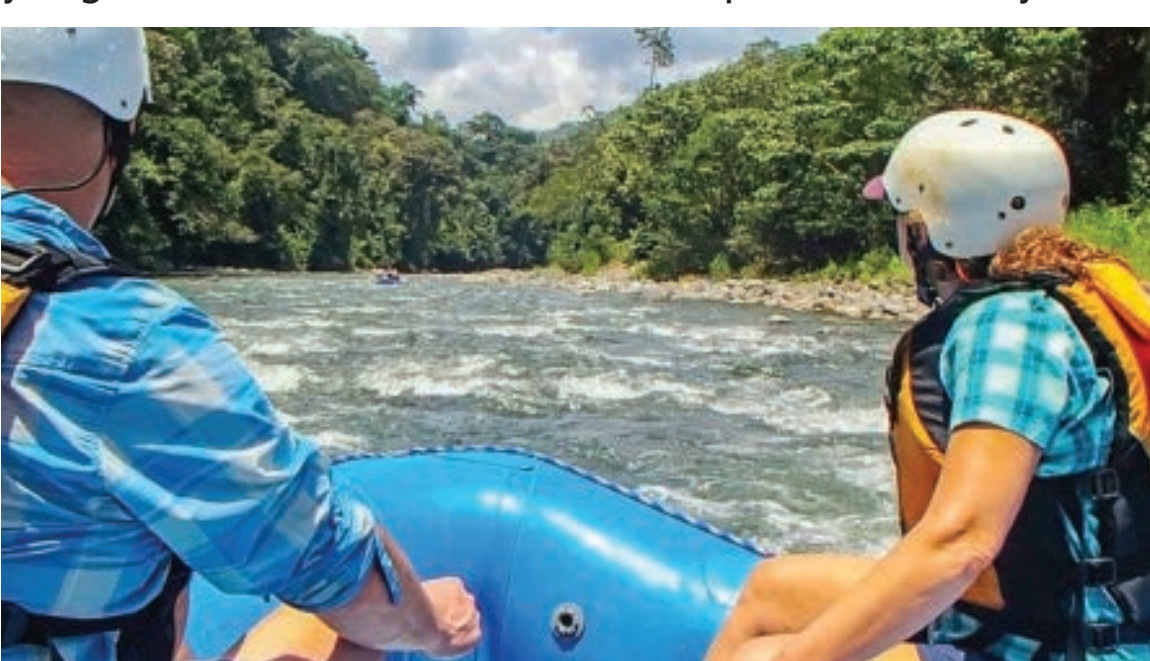
River runners rafting to Pacuare Lodge encounter easy Class 2 rapids. On the return journey, they can expect heart-pounding class 4 and 5 rapids downstream.