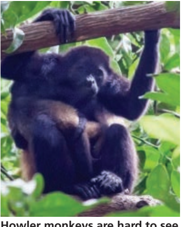
Howler monkeys are hard to see but easy to identify; listen for their loud throaty howls.