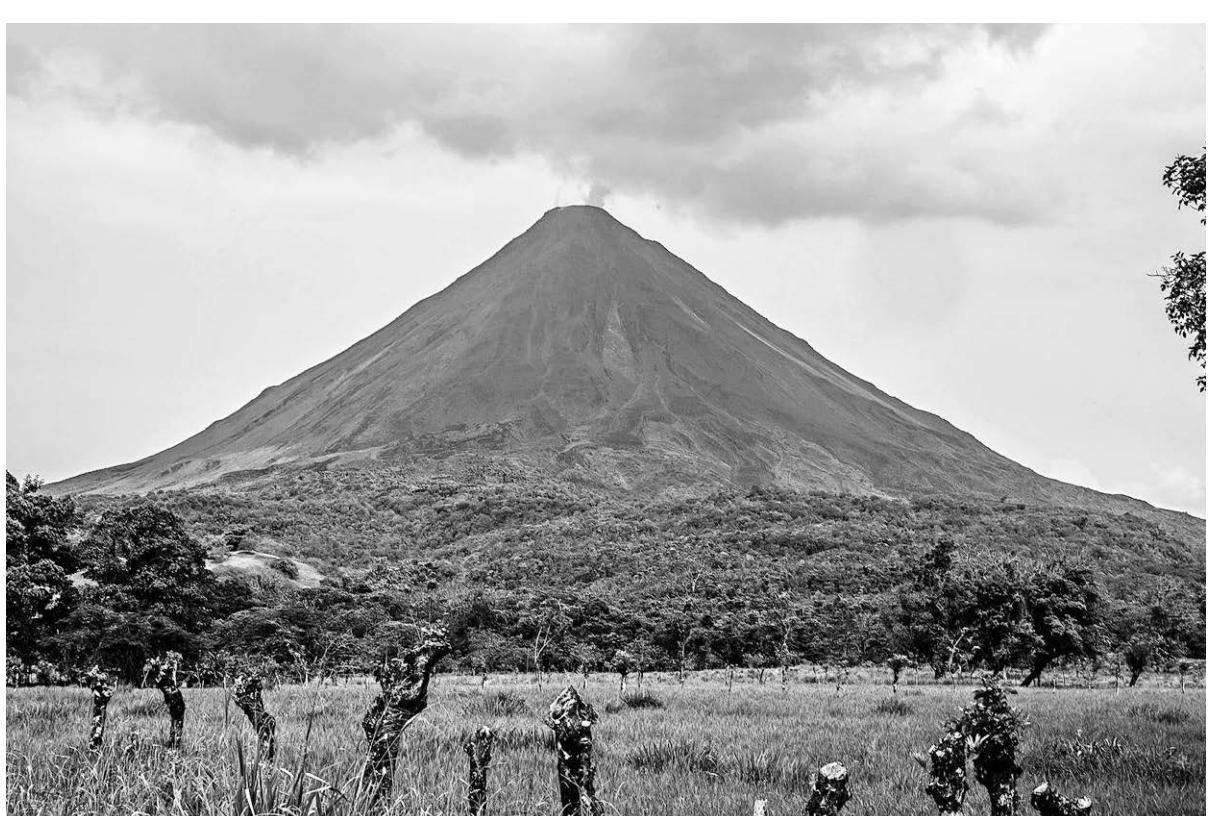
Arenal Volcano's unexpected 2010 eruption reminded observers that Central Costa Rica's most famous feature can be unpredictable.