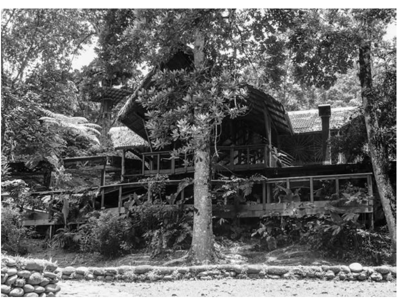
Pacuare Lodge, a National Geographic-designated Unique Lodge of the World, has more than 18 guest cottages.