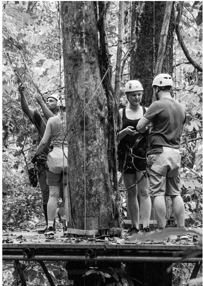
Like much in Costa Rica's rainforest, the Pacuare Lodge's Canopy Adventures zipline orientation starts up in a tree.

cliff-side barbecue circle faced the sunset. With a staff of 12, including asking about wine-pairings. We butler and three chefs, this luxuricould borrow a kayak or fishing