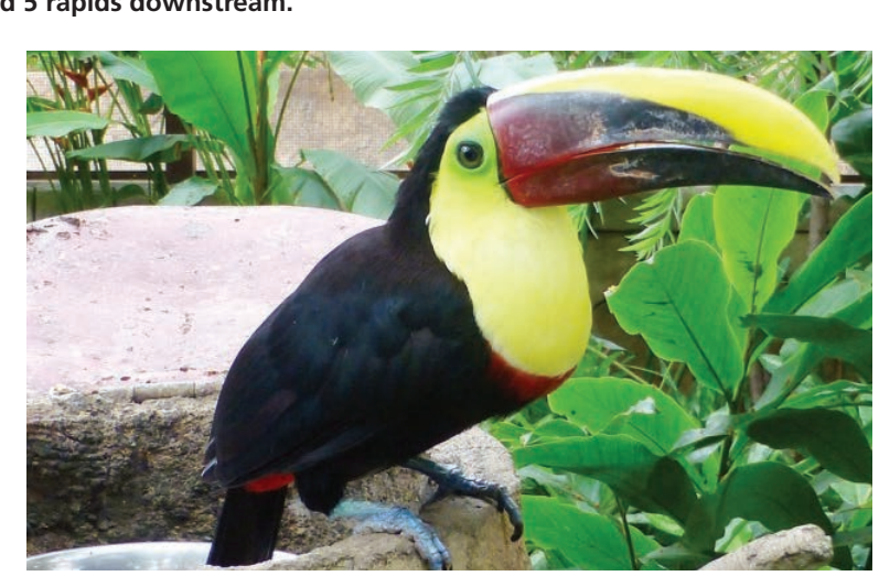
Keel-billed toucans, bright-coloured and slow-flying, are easy to spot in dense rainforests such as those in the Pacuare River gorge.