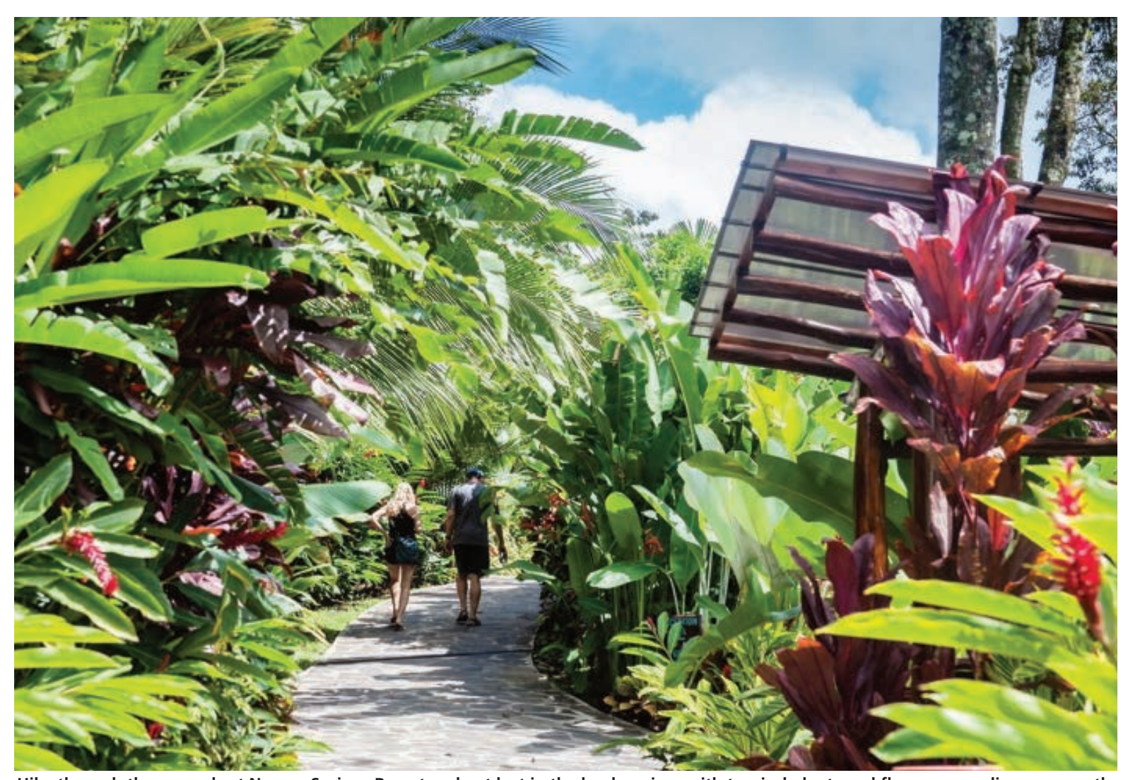
Hike through the grounds at Nayara Springs Resort and get lost in the landscaping, with tropical plants and flowers crowding every path, enhancing every pool and flanking every restaurant.

■ COMICS, D2 ■ RICK STEVES, D4 ■ WEATHER, D12