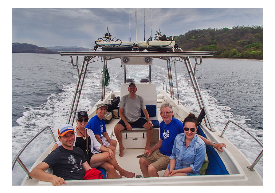
Almaco Ocean Experiences' tours and picnics, pick up passengers at Nacascolo Beach.

At Villa Manzu, keeping things running smoothly is accomplished to a "t" by a dedicated staff of 22, including two on-the-spot managers – a husband-and-wife partnership – and a butler, three chefs, a ground crew, maids and drivers. Comfort and privacy are guaranteed, which is why Manzu's list of illustrious visitors – celebrities, tech-company millionaires, movie moguls and the like – remains a secret. You could be one of them.