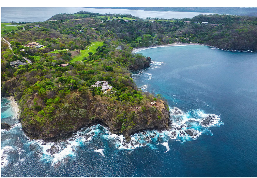
Aerial views of the Papagayo Peninsula, on the northwest corner of Costa Rica, reveal the 30,000 square-foot mansion, the Villa Manzu, is splendid isolation, alone on five green acres, Villa Manzu, Costa Rica.

If you can answer "yes" to three essential questions, a dream vacation at Villa Manzu, on Costa Rica's Papagayo Peninsula, may be in your stars.