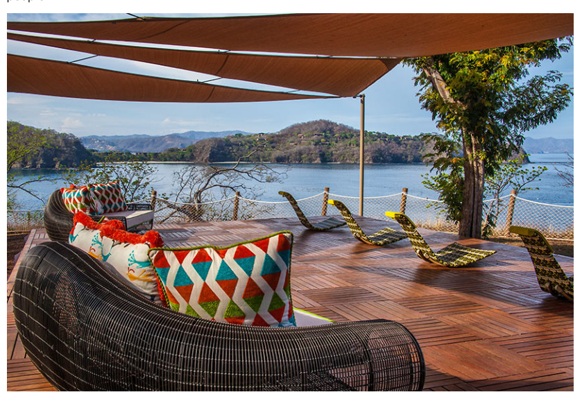
Plant trees around any Costa Rican deck and monkeys will be regular visitors, Villa Manzu, Costa Rica.

Do you have a dozen or more buddies, besties who've been vaccinated for Covid-19 and are itching to get out of the house? Are they the free-wheeling sort, willing to splurge, always up for an adventure? Lastly, are they cheerful and tolerant, relaxed enough to share a house with 21 other