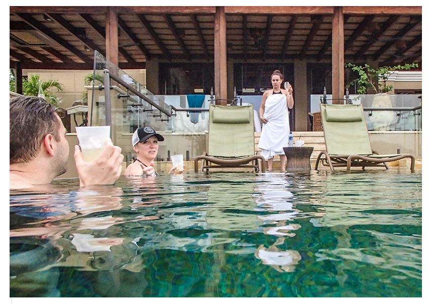
A slow afternoon in the pool, at Villa Manzu, Costa Rica.

On the main level again, we followed an outside staircase down to lower level and a second, more private pool with a waterfall, around the corner from a casual party room, bar and a small theater. Crossing the lawn below, we found the path downhill to the beach. Another path, to the west, wound through the trees to the cliff and a viewing space set up with a fire circle and benches, arranged to catch Costa Rica's spectacular sunsets.