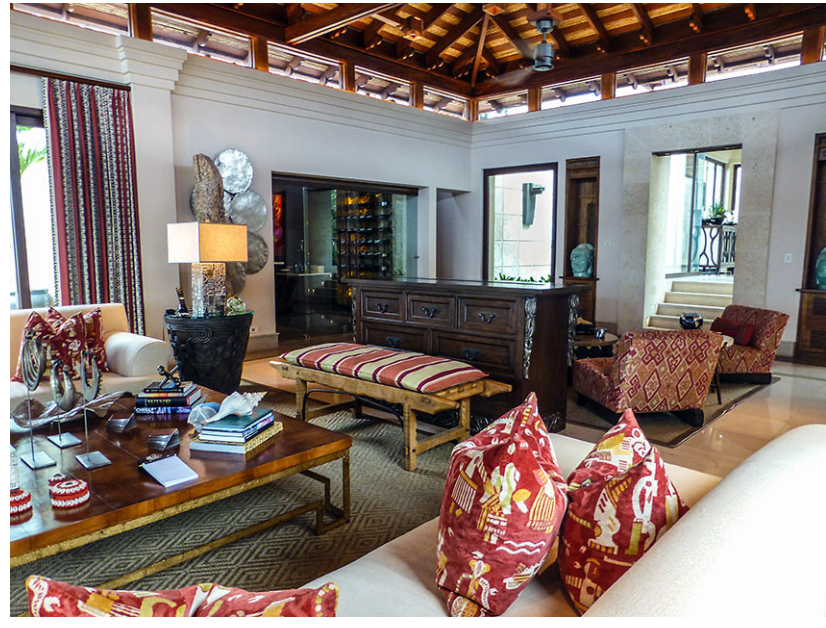
The design and décor in Villa Manzu's interiors reflect the arts of local and Southeast Asian indigenous cultures, Villa Manzu, Costa Rica.