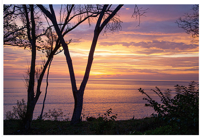
Sunset\ view\ over\ the\ Pacific,\ from\ Villa\ Manzu,\ Costa\ Rica.\ {\it Photo:}\ @steve\ {\it Haggerty/colorworld.}

On the main level again, we followed an outside staircase down to lower level and a second, more private pool with a waterfall, around the corner from a casual party room, bar and a small theater. Crossing the lawn below, we found the path downhill to the beach. Another path, to the west, wound through the trees to the cliff and a viewing space set up with a fire circle and benches, arranged to catch Costa Rica's spectacular sunsets.