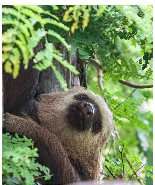
Three-toed sloths at Diamante Eco-Adventure Park's zoo, near Playa Matapalo, a half-day outing from Villa Manzu, Costa Rica.

Six weeks later we – my partner and I – were on our way, flying into Liberia Airport, where a Manzu driver was waiting. Forty minutes later, driving out onto the exclusive Papagayo Peninsula, we got our first look at the house, an adobe-