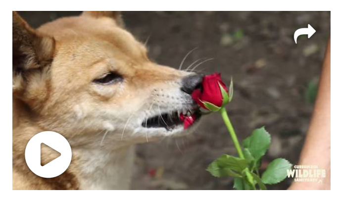
These zoo animals are baffled by Valentine's Day roses