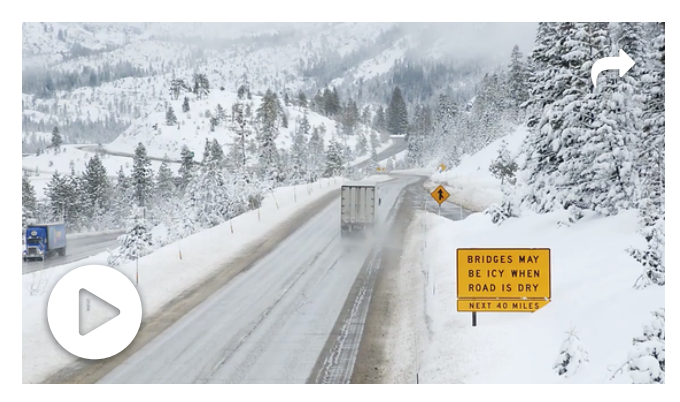
Winter driving tips for motorists heading to higher elevations