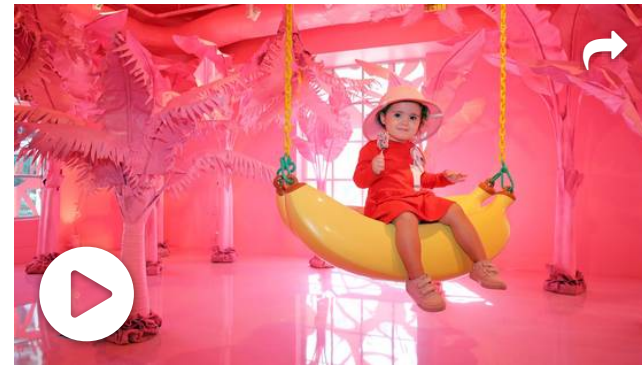
Taste, smell, swing and even swim at this ice cream museum