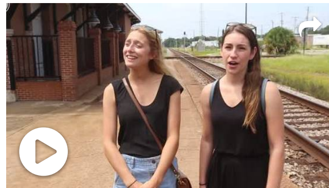
Small towns, especially the ones on the Mississippi Coast, are the best