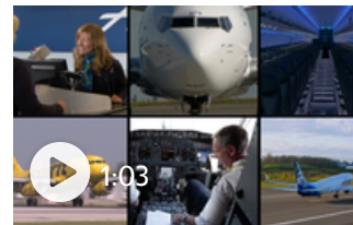
The best airlines of 2017