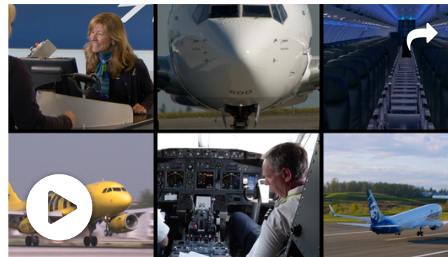
The best airlines of 2017