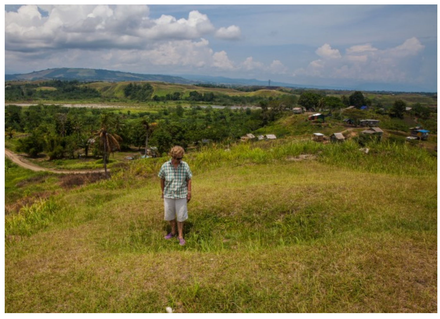
The foxholes in Bloody Ridge, one of the grassy hills above Honiara, a rude exception in this pastoral set reminder that 40 American Marines died here in 1942, defeating the attacking Japanese.