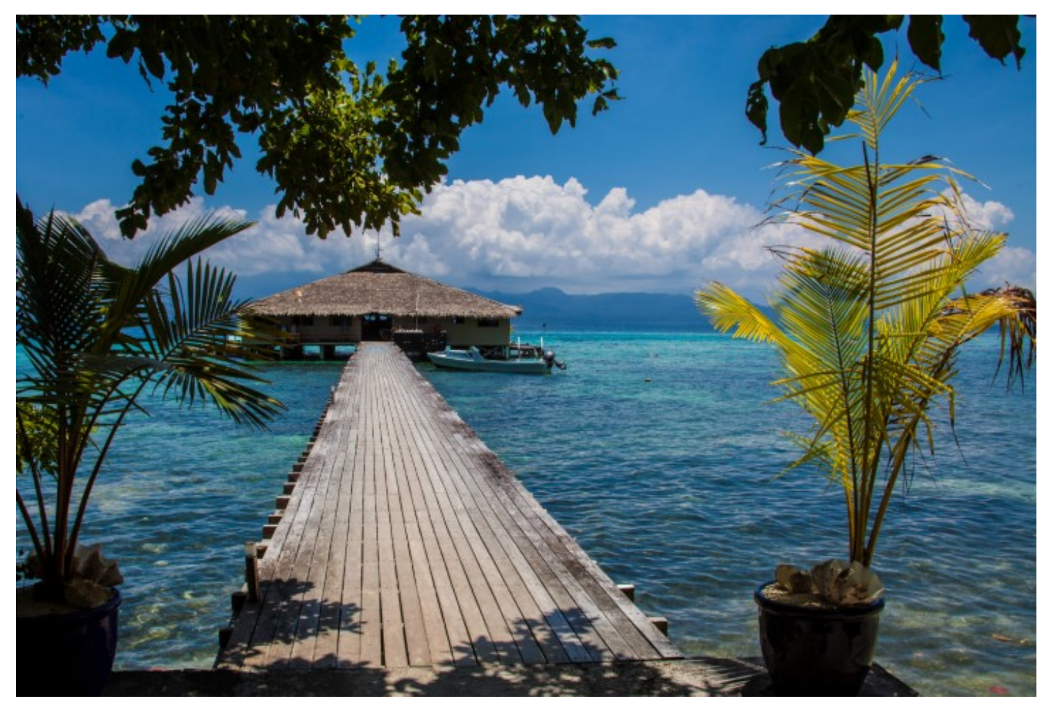
The 100-foot-long pier at Fat Boys Resort connects the Lodge, built on stilts over deep water, with a halfbungalows on shore. The lodge location — the bar, dining room, lounge and kitchen — protects the shoreli water coral and provides a boat dock.

After touring Guadalcanal, we flew we flew north to a one-room water-side airport on Gizo, or and then to Munda, on New Georgia, in the Western Province. The gateway to pristine rain for mountains, blue lagoons and sandy beaches, the Western Province was made for adventurers driver and a Fat Boys motor boat, we hopped aboard and in minutes we were speeding away ( blue lagoon to the dock.