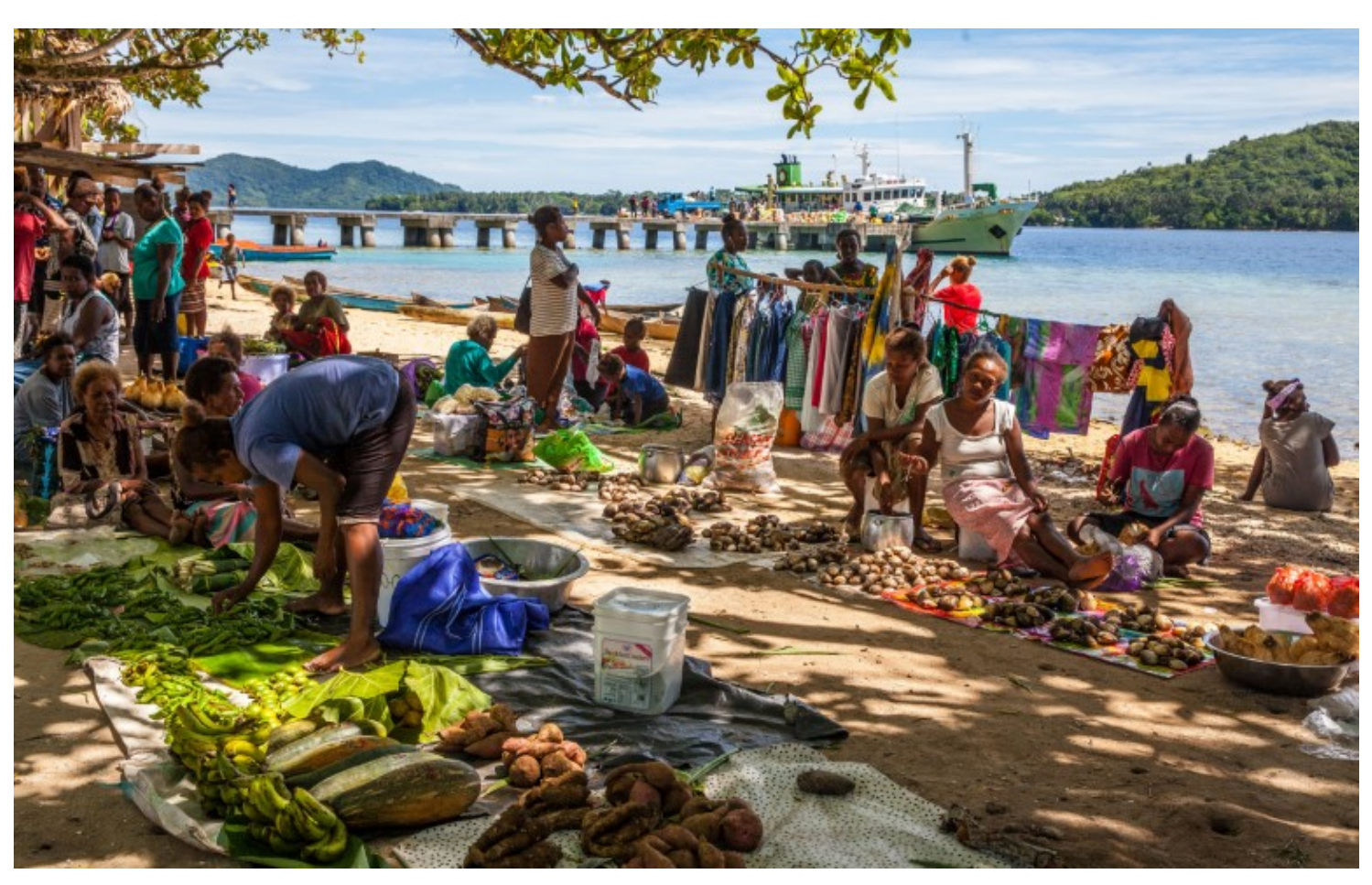
Local markets bring friends together, to share news and to shop for home-grown fruits and vegetables. Als given away — are piles of second-hand dresses and shirts, baby clothes, blankets and fabrics, items donate in the U.S. and other first world nations. Shipped to related churches overseas, they end up in rural comm

When it comes to picking a flight, Fiji Airways' non-stop, overnight flights from Los Angeles ar choice. The airline's gleaming new plane — an Airbus A350-XWB — has private beds in the fro seats in the rear, with an overnight flight that lets you sleep. We arrived early enough for a se breakfast in Fiji's Nadi airport and plenty of time to board the Solomon Airlines three-hour flig On arrival, I took advantage of the "tourist special," a SIM card good for 75 minutes, priced a The rest of the day we spent in the Heritage Park Hotel garden and pool, and booked a tour fc day.