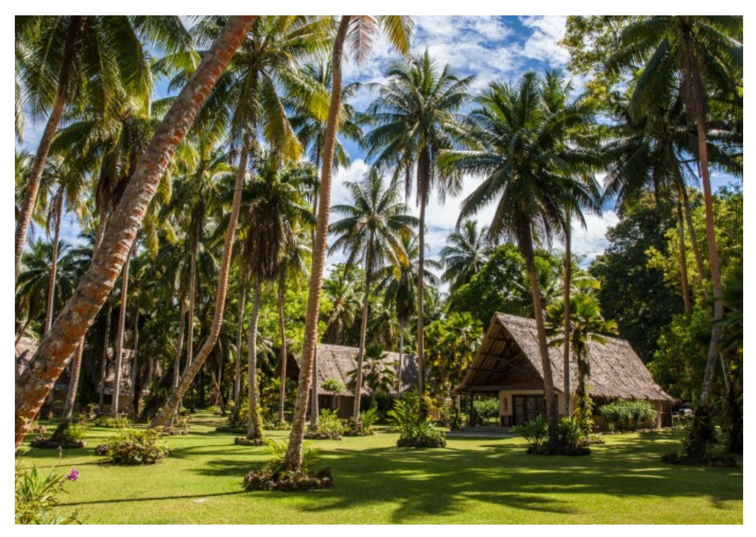
South Pacific chic reflect the mood at classic bungalows, in the shade at Tavanipupu Resort and Spa, so Guadalcanal.

park's ancient keeper, who lives in a tent near the pier. Hustling over to us, he produced a car of the youthful Kennedy which belongs on the monument but which he hides at night. "It's be recovered twice," he said, as we snapped photos.