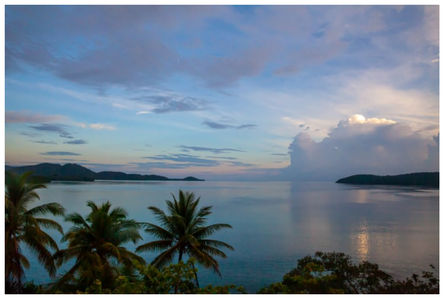
A scene found almost every evening and on most islands: Layers of pink clouds fading into a purple twilight of steve HAGGERTY@COLORWORLD.

We were still jetlagged when Andrew pulled up the next morning, driving a two-year-old, shin was impressed but he apologized. "All our cars are Japanese and they're all second-hand. We ones," he said. "Never. And see this? The Japanese are building the overpass and paving the s taking forever," he added, as we inched past grimy storefronts and vegetable stands overflowi greens, tomatoes and squash. "That new one, where everybody shops, is owned by a Chinese said, nodding at a big-box department store, the kind China builds in every willing mineral-ric country. We've seen these "gifts" before. They are there to smooth the way for future highway contracts.