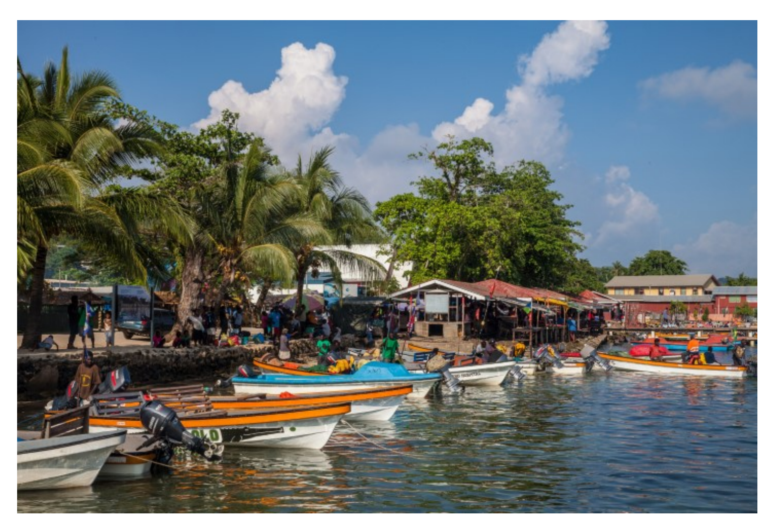
The dock at Gizo, population 6150, the largest town and commercial center in the Western Province, is bus Day, when sellers, buyers, families and fishermen come from nearby islands.

It was party time the next day in Gizo, the main town on Ghizo Island, at the Friday market. F home-made dugout canoes docked at the waterfront, buyers crowded the aisles, coins change sellers hailed friends and old ladies filled their shopping bags. Everyone smiled, asking where and offering to pose for photos. Ngali nuts — the holy grail of island snacks — were in season up with a half-dozen packages in folded-leaves. Green taro leaves competed with slippery spir spinach), purple bananas, four or five kinds of potatoes, carrots and betel nuts, a popular and substitute for coffee or cigarettes. "What do they taste like?" I asked an older man with red-ri (the give-away), who offered me a seat in the shade. "Do they make you feel relaxed?" I vent