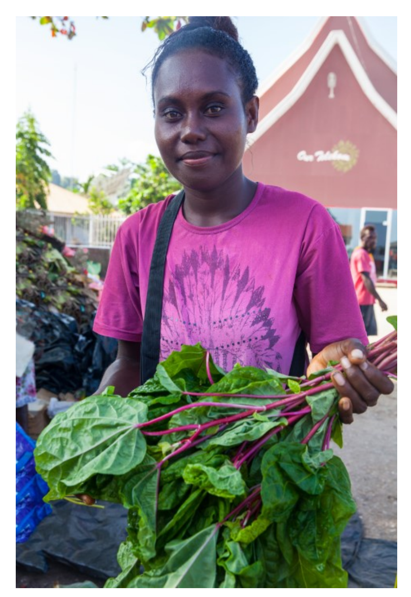
Green vegetables come with big leaves in the tropics. The helping her parents at the taro leaf stand in Gizo, wanted t we were from and whether we liked her country.

Flying on to Munda, famous for wreck diving, we checked into the Agnes Gateway Hotel on the waterfront, a group of rooms and spartan cottages advertised in scuba and backpacking magazines. Our cottage was beyond plain but it had a front porch with chairs, and hooks and a clothes line for bathing suits and diving gear. The restaurant and bar, conveniently adjacent to the check-in desk, served hearty, tasty affordable meals. Booking a boat tour out to Skull Island — the last stop for many a victim - now a popular tourist highlight — we joined captain Billy Kere, 40-ish and friendly, and as he introduced himself, a "descendant of the Roviana headhunter clan." Once past the coral, Kere cranked up the speed and we roared out over the deep water for 5 minutes, the bow pounding the waves until we reached the island, a small pile of slippery rocks and sharp coral (wear tennis shoes). The skulls inside this gloomy cavern were piled high on every side, with more on a small altar, near a cement plaque where — where it is said — the headhunters buried a well-intentioned but unlucky Christian minister.