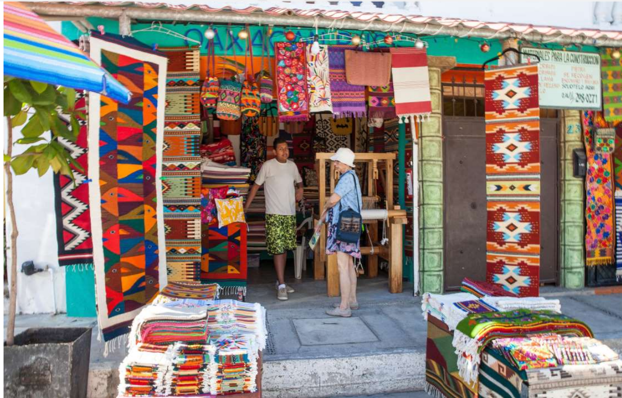
Mexico's many arts and crafts include woven fabrics, for sale here in Bucierias, on Banderas Bay, north of Puerto Vallarta.