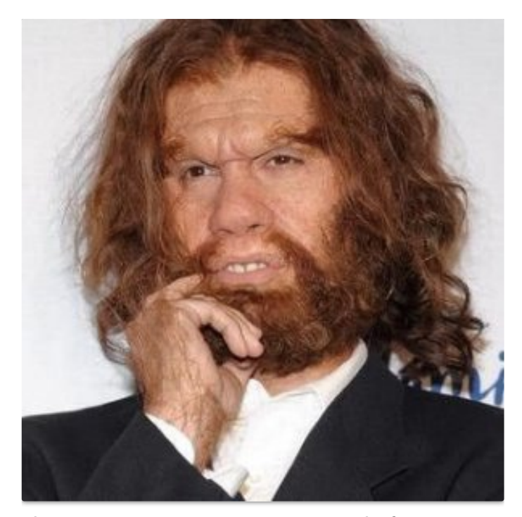
This GEICO Caveman is Gorgeous in Real Life