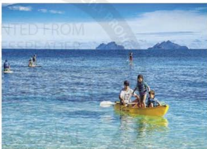
There’s no charge for sit-on-top kayaks, sailboats and paddle boards at Castaway Island Resort, Fiji.

When the kids were toddlers, in St. Lucia, we built sandcastles together while their parents slipped away for a sunset cruise. In Toronto, we played Marco Polo in the