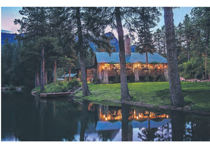
After the Broadmoor Hotel changed hands, in 2011, the new owner restored and enlarged the lodge and built guest cabins at the Ranch at Emerald Valley. Rates start at $485 per person, including meals, drinks and more.