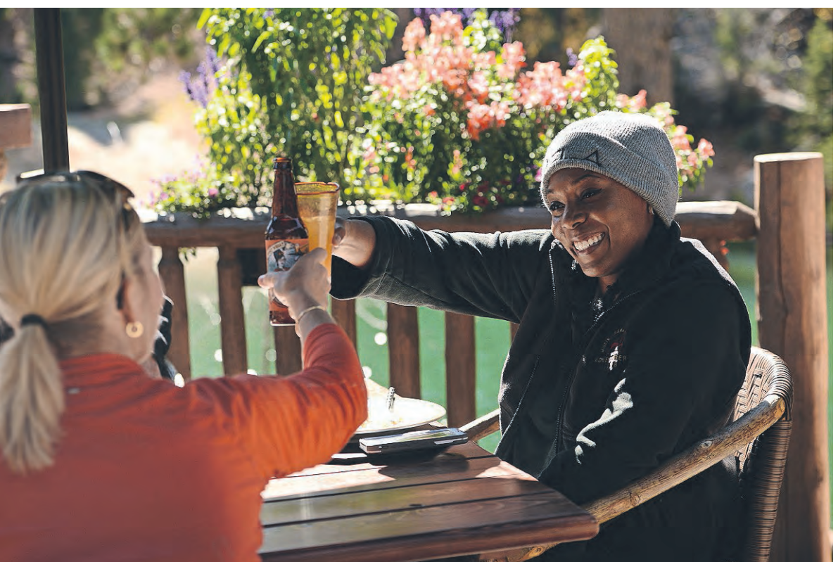
Cocktail hour follows an afternoon of fishing, and dinner lasts as long as you wish to eat or talk in the dining room or around the campfire.

Here at the Ranch at Emerald Valley, at the end of the track they once called the Gold Road, I think they've hit pay dirt after all.