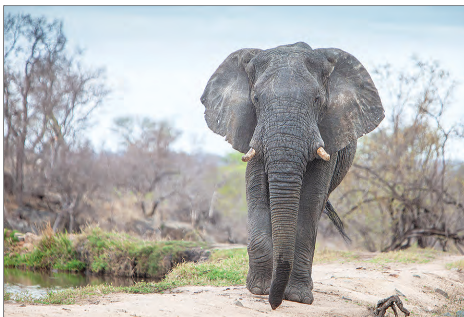
Size matters when two forces meet. Flapping ears tells us to back off and give him space at the South Luangwa National Park, Bushcamp Company, Mfuwe, Zambia.

Built of logs, planks, reeds and thatching, the cabins were a work of art. And with striped pillows, African colors, flush toilet, running water, screens and a single solar-powered nightlight, I felt right at home. But the lodges weren’t