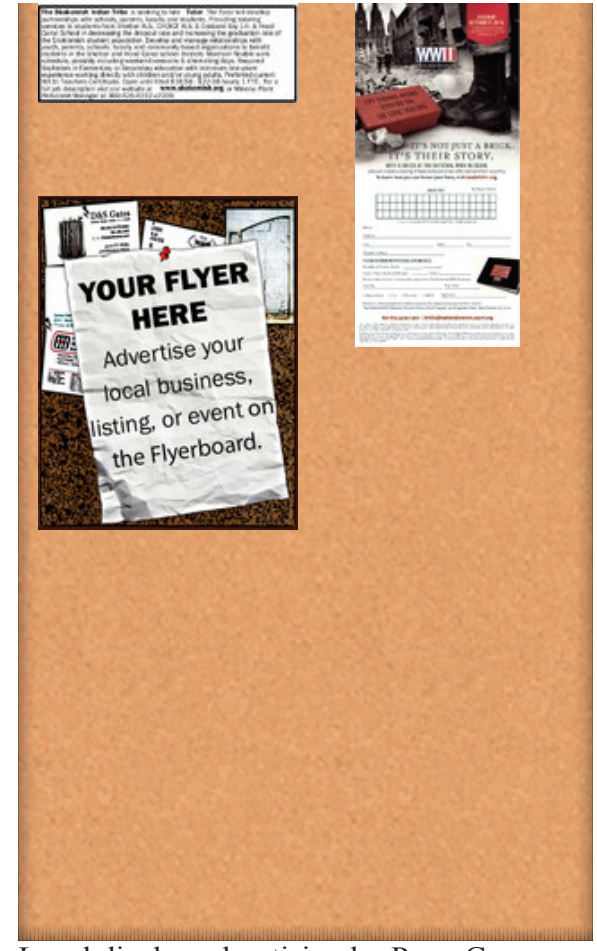
Local display advertising by PaperG

The lions that killed and ate the buffalo, the bush babies in the Mahogany tree and the discovery – to our mutual astonishment – that our fellow guests, a couple from England, live next door to my English cousins.