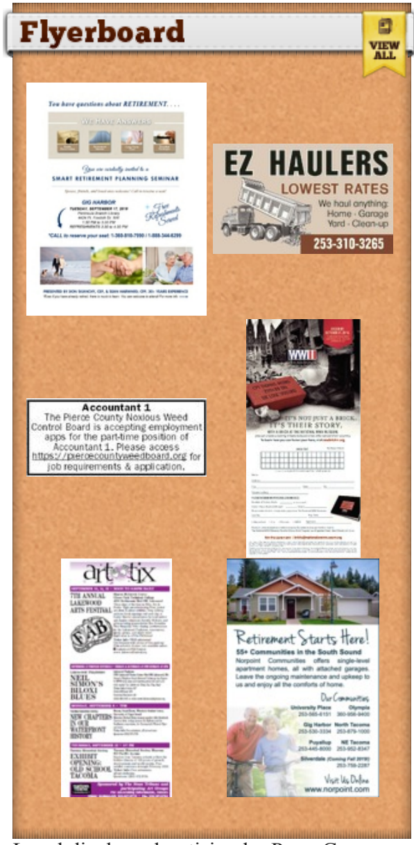
Local display advertising by PaperG

We spent our last week in South Africa at two very different safari lodges, the starkly minimalist Earth Lodge and its partner, Bush Camp, a family-friendly resort, both in the Sabi Sabi Private Game Reserve.