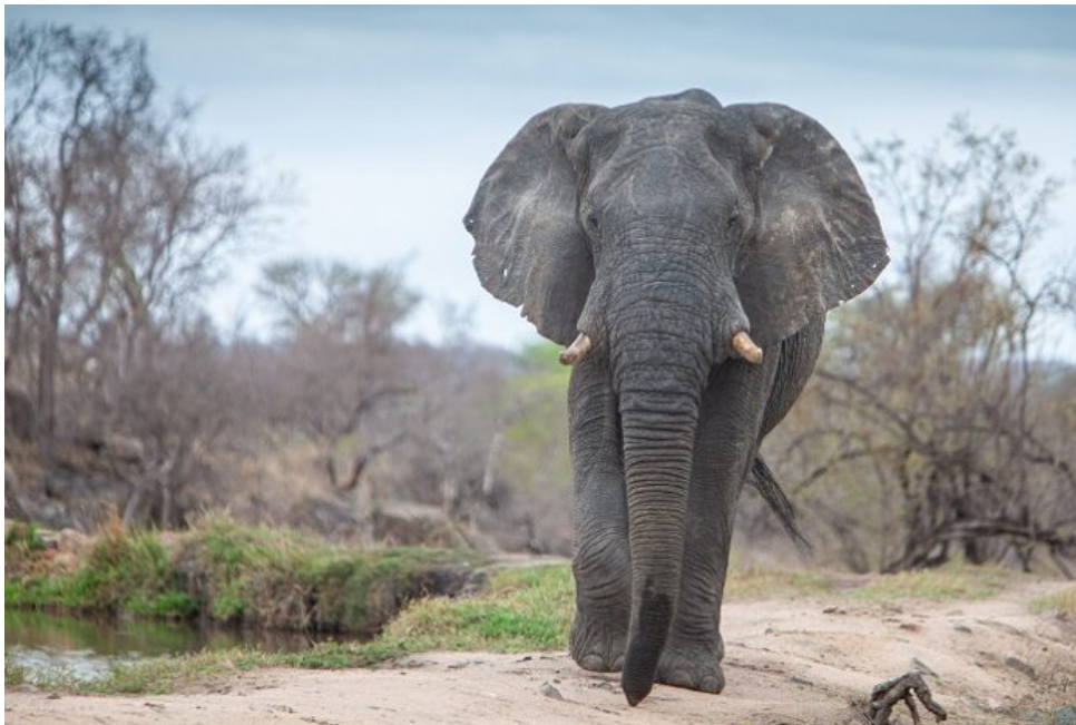
Size matters when two forces meet. Flapping ears tells us to back off and give him space at the South Luangwa National Park, Bushcamp Company, Mfuwe, Zambia.