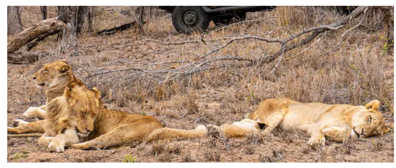
Earth Lodge's expert trackers Lazarus and Louis strike gold: a pride of lions sleeping off dinner.

But the lodges themselves couldn't have been more different. Channeling the Neanderthals, Earth Lodge's 13 luxury suites were caves, richly decorated dugouts in the side of a hill. We sat in our plunge pool outside the front windows and watched impalas graze in complete privacy.