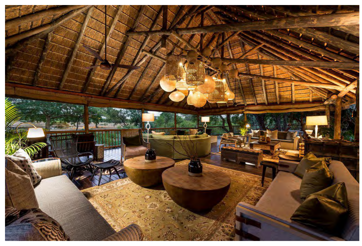
Bush Lodge, a family-friendly spot with 25 luxury suites, is located in South Africa's 160,000-acre Sabi Sabi Private Game Reserve, on the border of Kruger National Park.

Finally, a flight to Skukuza, in South Africa, for a visit to Earth Lodge and Bush Lodge , in the 160,000-acre Sabi Sabi Private Game Reserve, on the border of Kruger National Park. Sixteen days, six game-lodge destinations, and none of them alike.