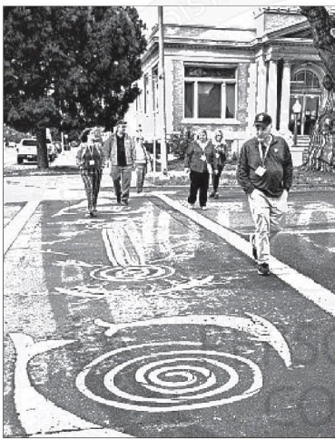
Lompoc is known for its art and a culture that supports creative design in every form, from murals to crosswalks.