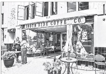
Need advice on what to see? Ask the friendly staff at South Side Coffee Co., in Old Town, serving breakfast, lunch and, of course, coffee.

Uptown Cafe, (don't miss this place, the town's top-rated restaurant), notable for Painter John Pugh's trompe l'oeil ship, which seems to be crashing through the wall, we talked about other tourist attractions. I'd noticed that Lompoc has two golf courses. The biggest draw, said Ostini, are the vine-