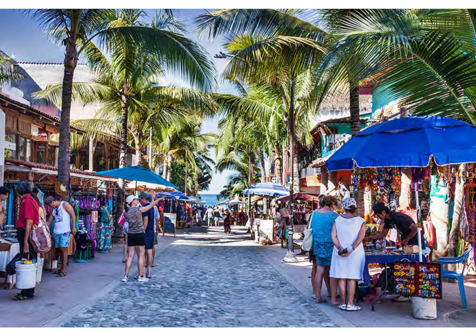
Travelers shopping on the Riviera Nayarit's cobblestone streets – in Bucerias, San Pancho and Sayulita (see should remember to wear good shoes.

Then it was on to San Pancho – officially, San Francisco – where iguanas live in the trees shad central plaza and where I bought a primitive painting from a sidewalk artist.