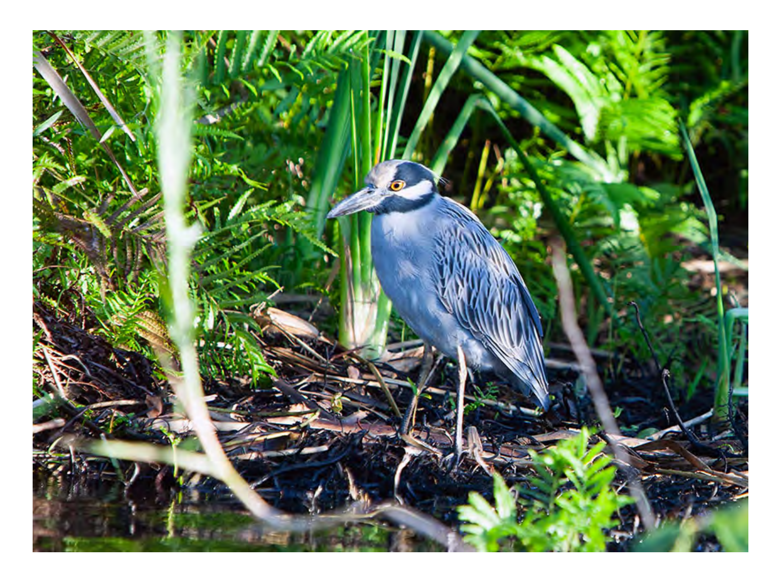
Sightings of black-crowned night herons, seen here in La Tovara Park, are rare. Usually found near water immobile on bushes or rocks and perfectly camouflaged, they're difficult to spot.

is, until it became another one of the best adventures we didn't plan. Gliding quietly upstream estuary, spotting rare birds at every turn; winding among the mangroves until the estuary me river; watching the clear water curl around the muddy water and the sun-loving flowers crowc banks; La Tovara Park was as enchanting as El Delfin dinner was unforgettable.