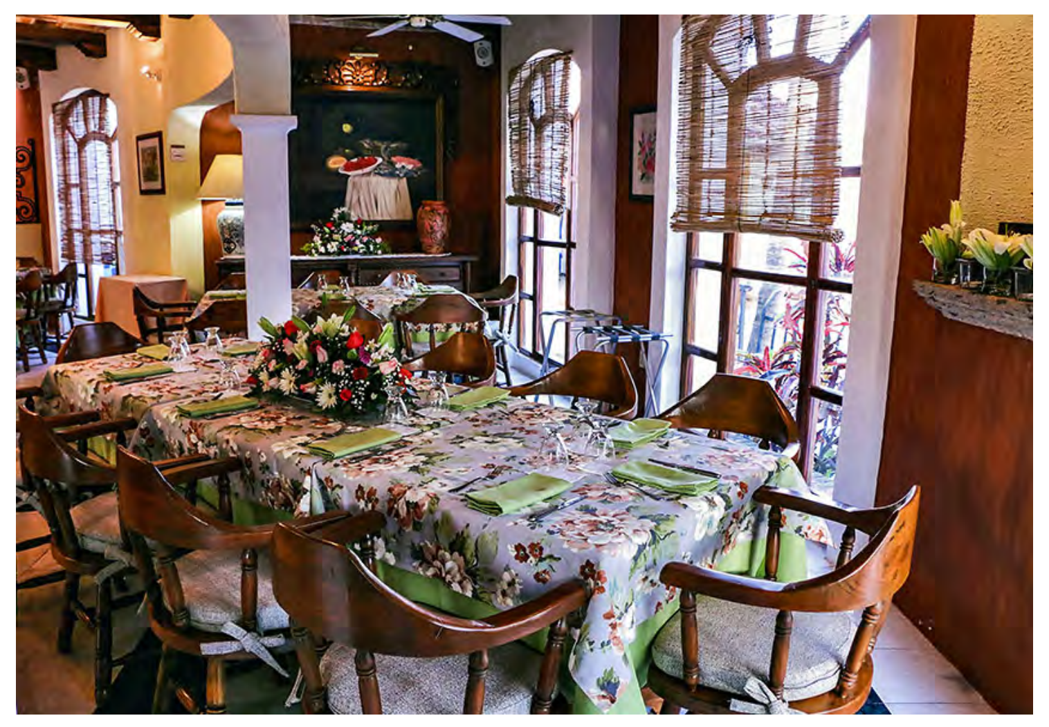
El Delfin Restaurant.