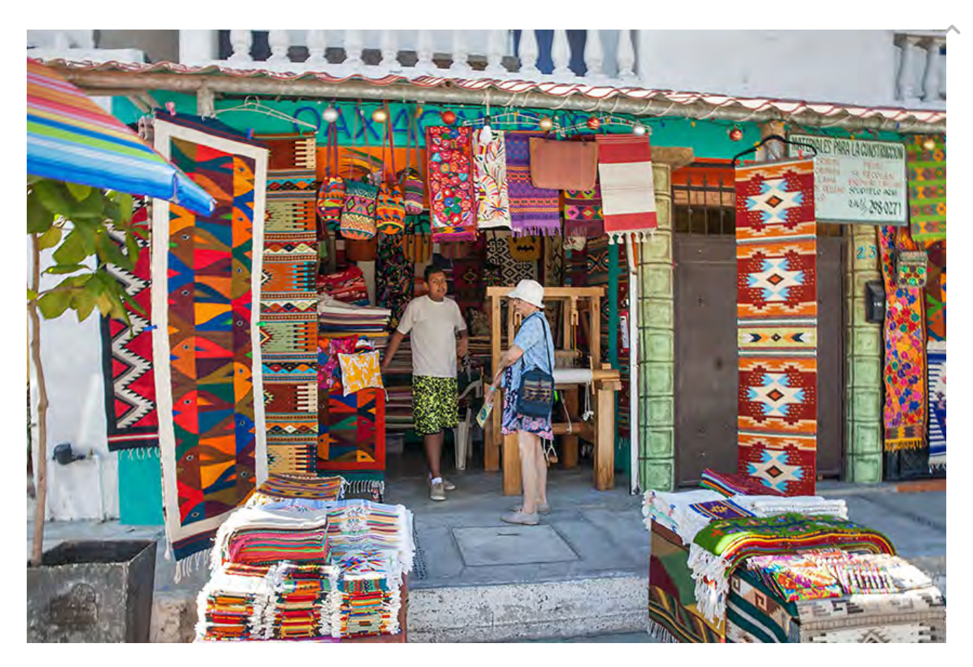
Mexico's many arts and crafts include woven fabrics, for sale here in Bucerias, on Banderas Bay, north of Vallarta.

Thanks to my parents, inveterate travelers, Mexico was familiar country. But we'd never explostate of Nayarit or its spectacular western border, the Pacific coast. Leaving the PV cruise ship the airport behind, we crossed the border north into Nayarit, leaving the tourist world – crowc souvenir shops, shopping centers and tourist hotels – behind. Within minutes, the landscape of to open country, interrupted here and there by fields, jungle thickets, giant trees, crossroads houses and an occasional village. According to Steve, who'd done his homework, San Blas, po just 8707, was once an important port. At the mouth of a river, it was a source of fresh water, necessity when, in the 1500s, Spain's "treasure ships," sailing northeast from the Philippines I silks and spices, made landfall. Repurposed as an official naval base in the mid-1700s, it was from which the Spanish empire, threatened by Russia's settlements in Northern California and sent a company of soldiers and colonists north to build the missions, led by Father Junipero Se