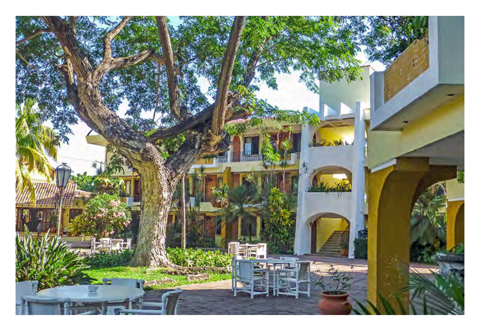
The Hotel Garza Canela, inside a private, walled hacienda, is surrounded by five acres of shade trees and Located in San Blas.

Heading for the hotel, a large, old-fashioned building behind a wall, we found the door, booked for the night, and asked about the restaurant, the El Delfin. "It's right there, through the door the patio," said Rosa, the desk clerk, pointing the way. "It's still early, so you'll be the only one Stepping outside, I realized that we were behind a wall in a multi-acre, traditional, colonial-sty hacienda, with a spacious patio and garden, leafy trees scattered about and two or three othe buildings. A swimming pool was visible in the distance, beyond the door to the restaurant.