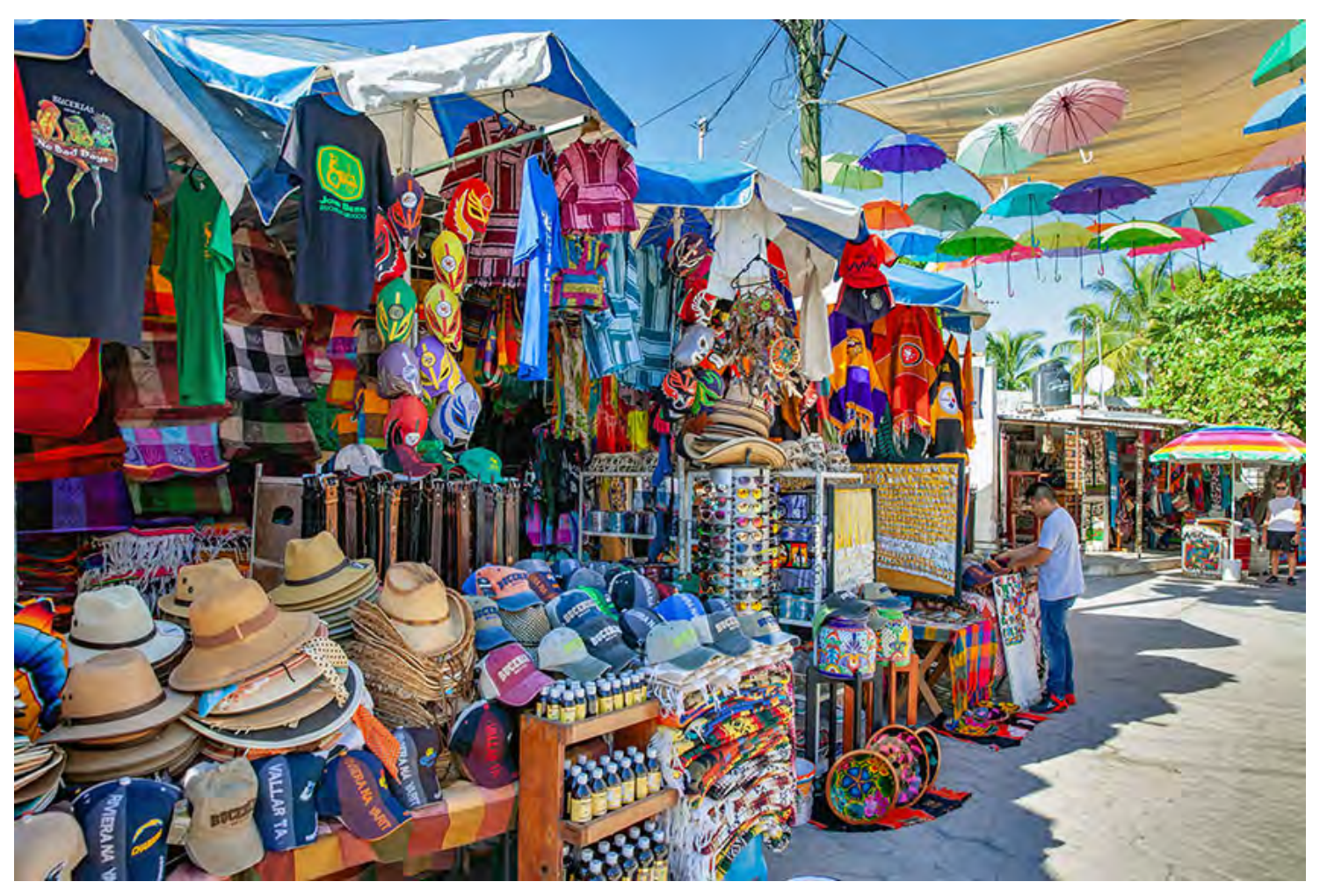
Mexico's arts and crafts include hats, fabrics, and leather belts. Bucerias, Banderas Bay, north of Puerto Vallby ©Steve Haggerty/ColorWorld.

We couldn't miss the next stop, at Sayulita, one of Mexico's historic "magic towns." Popular wi and famous for miles of surfing beach and endless waves, Sayulita's narrow cobblestone stree shaded by trees and lined by art galleries, craft shops, cafes, ice cream vendors, bars, cottage sheds, all crammed onto every buildable inch. Following mobs of shoppers, mostly Mexican va we found a beachside café, ordered ice tea and waded in the waves.