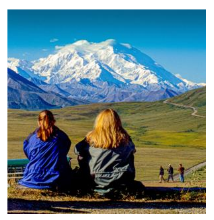
Amazing Denali, also known as Mount McKinley, its former official name, is the highest mountain peak in North America, with a summit elevation of 20,310 feet

Depending on the day, the Denali Star makes short stops in Wasilla, near Anchorage, or in Talkeeta. It may even