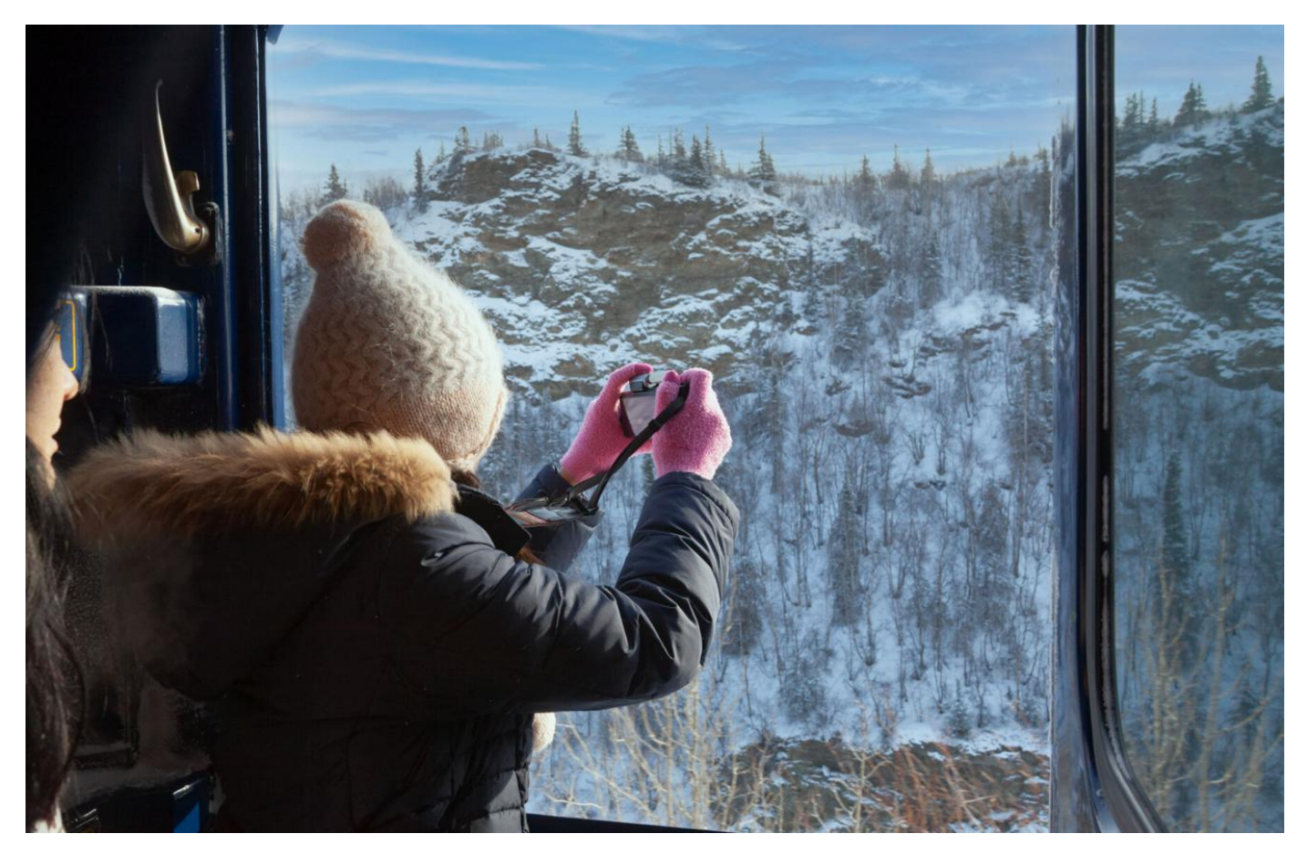
The Denali Star train, winding through the Susitna River gorge near Hurricane, slows down to make each turn.

So climb aboard, look out the window and step into nature's paint box. Ahead lie thick forests and wind-blown lakes, snow-capped peaks, rushing rivers and neon-green marshes. Look to the west and the Alaska Range appears, swathed in ice, 20,320-foot Denali Peak standing above the rest.