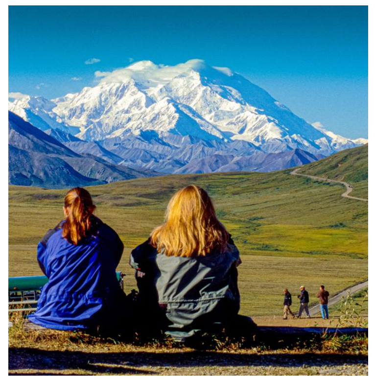
Amazing Denali, also known as Mount McKinley, its former official name, is the highest mountain peak in North America, with a summit elevation of 20,310 feet

Depending on the day, the Denali Star makes short stops in Wasilla, near Anchorage, or in Talkeeta. It may even