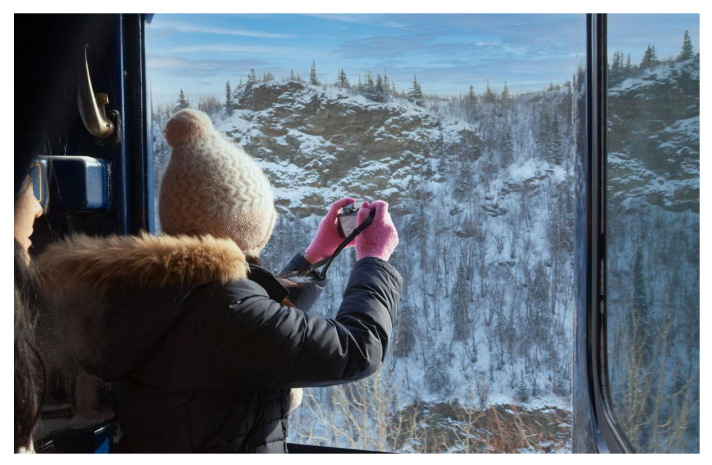
The Denali Star train, winding through the Susitna River gorge near Hurricane, slows down to make each turn.

So climb aboard, look out the window and step into nature's paint box. Ahead lie thick forests and wind-blown lakes, snow-capped peaks, rushing rivers and neon-green marshes. Look to the west and the Alaska Range appears, swathed in ice, 20,320-foot Denali Peak standing above the rest.