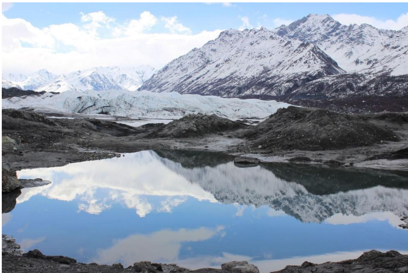
Picture of an iceberg with mountains in the background.