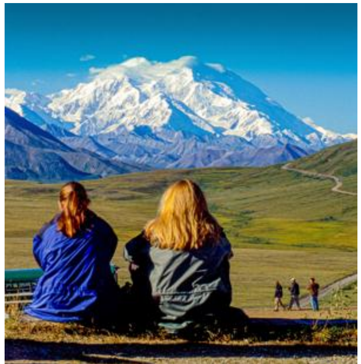
Amazing Denali, also known as Mount McKinley, its former official name, is the highest mountain peak in North America, with a summit elevation of 20,310 feet

Depending on the day, the Denali Star makes short stops in Wasilla, near Anchorage, or in Talkeeta. It may even