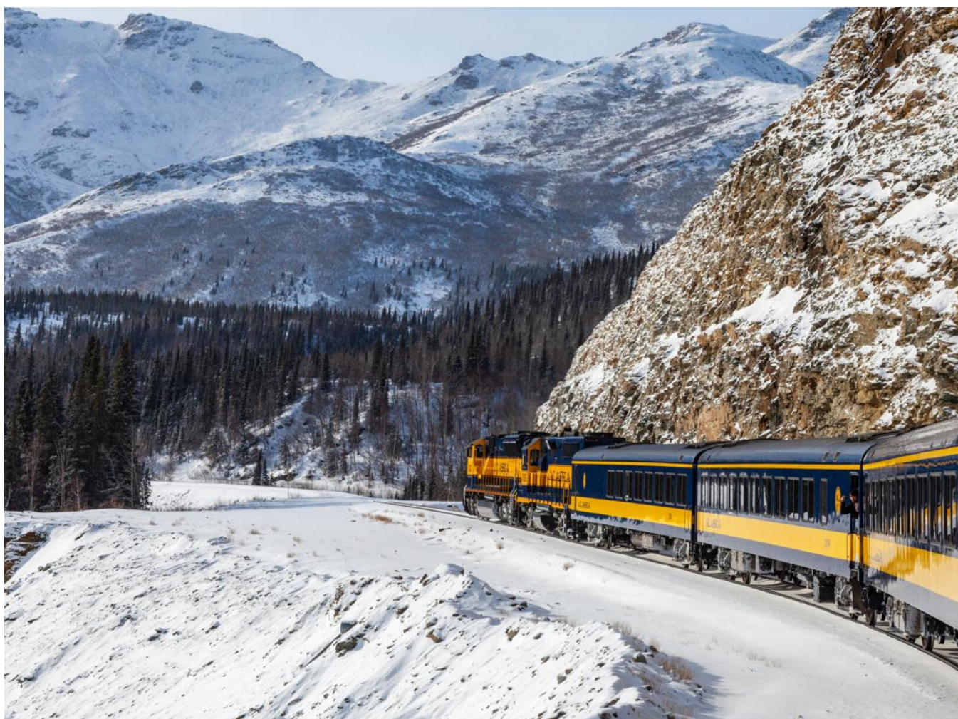
Denali Star passengers lean out between the cars to capture another hairpin turn in the Susitna River Gorge, near Hurricane.