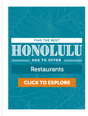
FROM THE WEB Sponsored Links by Taboola