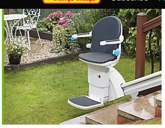
Wat kost een traplift?