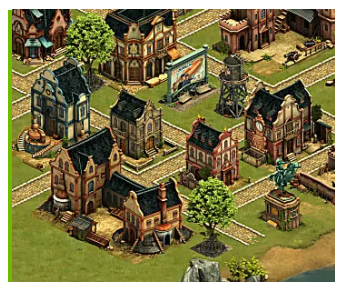
Het meest verslavende spel van het jaar