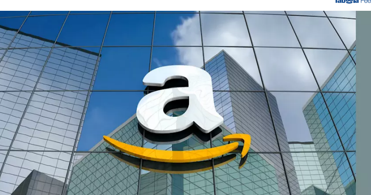
Wat als je een jaar geleden $1.000 in Amazon had geinvesteerd?