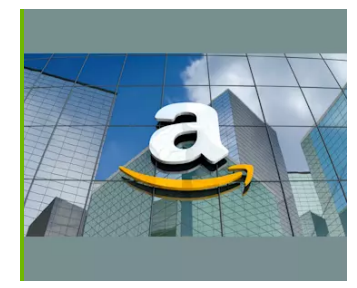
Wat als je een jaar geleden $1.000 in Amazon had geinvesteerd?