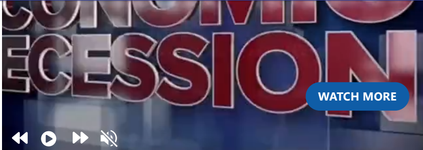
How to know if we're ina recession

Brown bears are loners. Bigger, heavier and more aggressive than their southern cousins, they avoid company, preferring distant hills, thick clumps of bushes and isolated creek beds.