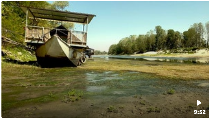
Feeling the heat: the cost of Italy's worst drought in decades