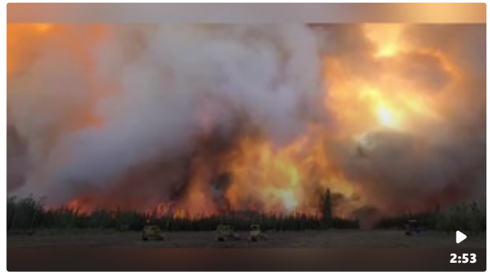
US firefighter: 'This abnormal weather is the new normal'