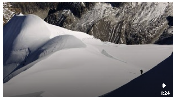
Mont Blanc warning as France heatwave causes more frequent rockfalls