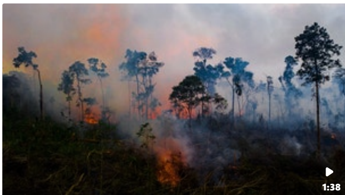
Unique solutions for the climate crisis