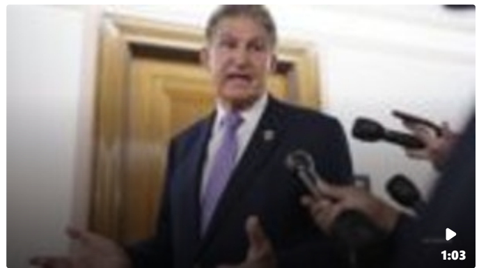
Manchin doubles back to support climate and energy package