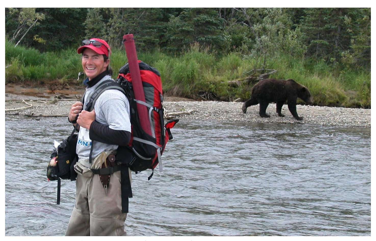
During salmon season, bears and fishermen share the wealth.

KING SALMON, Alaska — Are you lucky enough to be traveling to Alaska this year? I am. If you are too, we'll be two of an estimated 2.3 million visitors — cruise passengers, fishermen and independent travelers — heading north to "America's Last Frontier." After spending two years isolating at home, I'm more than ready for another trip to the 50th state. More than twice as large as Texas, Alaska has it all: mountains, glaciers, rivers, lakes, coastal bays, forests, tundra, even active volcanoes.