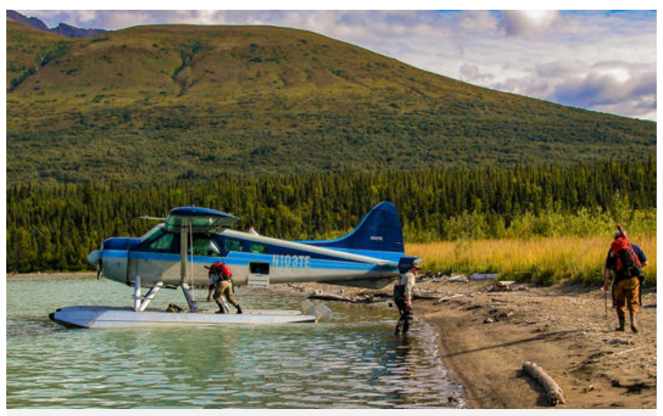
Floatplanes are Alaska's answer to roads

I was looking out the window at Denali, its snow-capped peak rising above the horizon, when the tour-bus guide suddenly hit the brakes, parked on the rim and grabbed his binoculars. "Over there! See the big rock, near the bushes," he said, jumping up and pointing across the valley to a distant spot. In an instant, the rest of us passengers were on our feet, too, crowding against the windows and each other, peering, squinting and guessing until finally someone jabbed a finger at a distant brown smudge that looked more like a haystack.