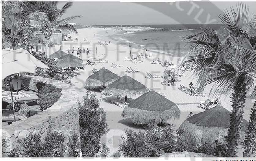
Enjoy sand, sun AND shade by choosing a beachside palapa at Hacienda del Mar Resort in Los Cabos, Mexico.