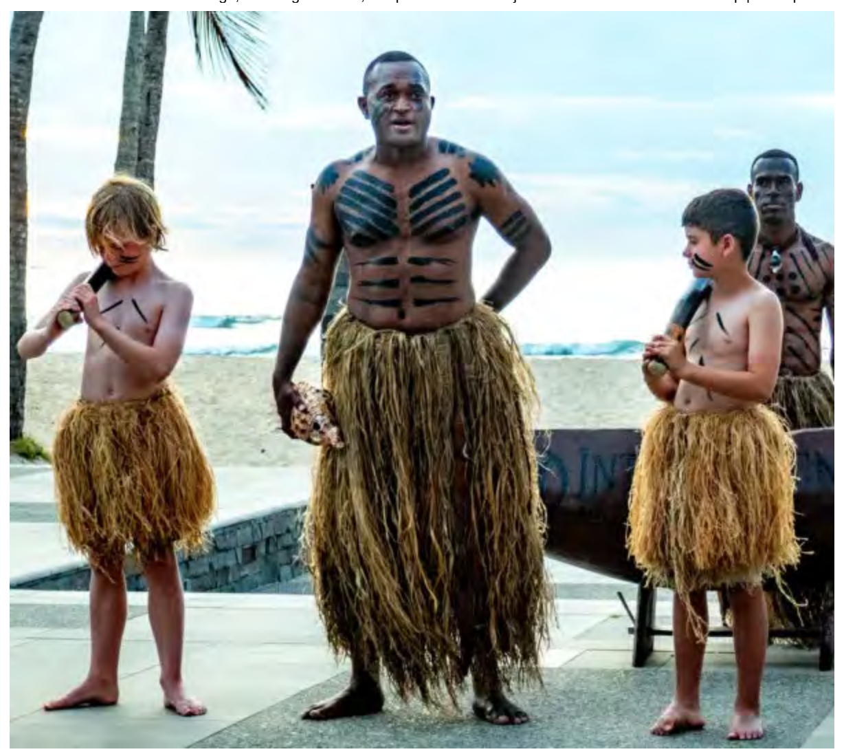
Daring travelers join a Fijian warrior at the Intercontinental Fiji Golf Resort & Spa evening Torch Lighting Ceremony, Fiji Islands.

As our last week approached, we took the ferry to Lomani Island Resort—yes, an adults-only beach resort—on Malolo Lailai island, a single hour's ferry ride to the mainland and Nadi International Airport. You can stay overnight and still make it to the airport on time.