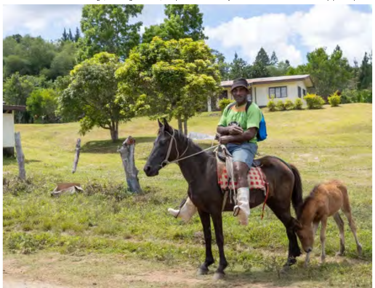
Horses are cheaper than trucks, say Fiji farmers, if you're out to see a neighbor.

The 35-mile-long trip ended at a village, with a tour, lunch at the community center and a kava ceremony—shared cups—with the chief and town fathers. Kava is calming, some say. Just more weak tea, say others.