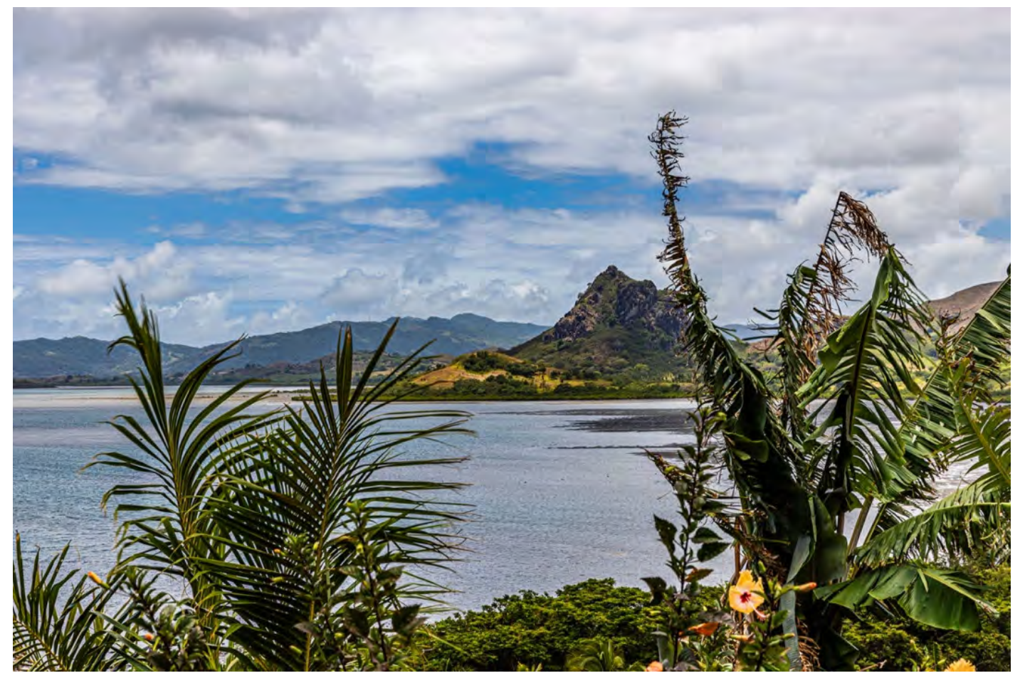
Folklore says that ancient spirits left the world from Uluvinavatu Mountain, on Viti Levu's northeast shore, Viti Levu, Fiji.