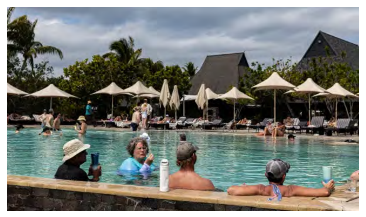
Families on vacation make new friends in the pool near the Toba Bar & Grill, Intercontinental Fiji Golf Resort & Spa.

But it wasn't the beach that earned the gold star. It was the charming cottages, each with a private yard and plunge pool. The smiling waiters and creative, chef-designed meals, served at candle-lit tables. The "double-X" swimming pool and the water sports center.