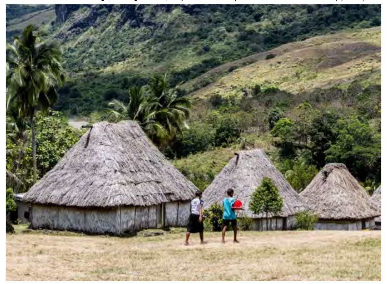
Navala Village, Fiji's last traditionally thatched village, is an hour from the Fiji Orchid Hotel and welcomes visitors.

"This is how we used to build houses," he said, leading us inside the chief's official structure, where a couple of village leaders sat cross-legged, talking. "They built it in 1954 when five dying Catholic villages joined together," he continued, leading the way to the school and church.