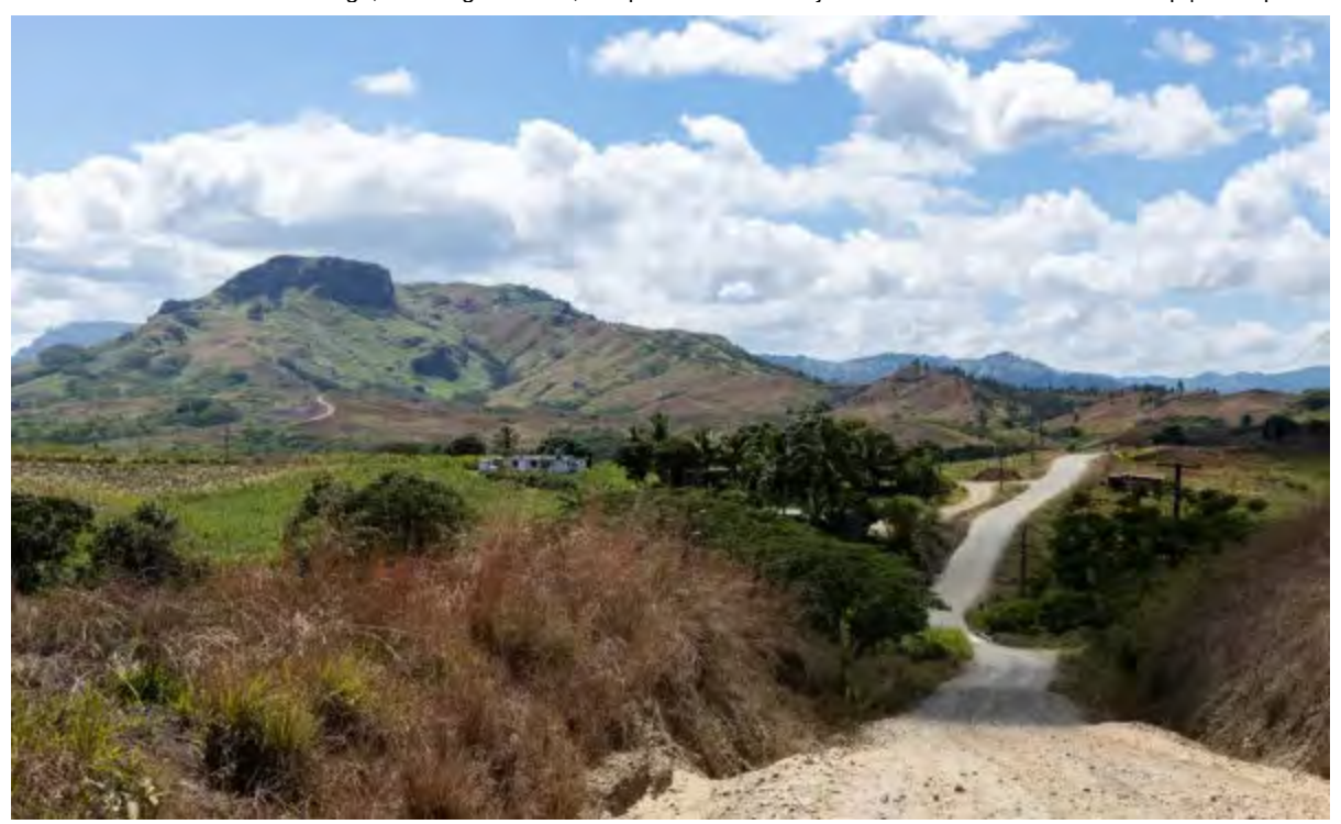
The Nausori Highland Road, scaling ancient lava slopes, reveals the origins of Fiji's birth.

Moving to Viti Levu's southwest corner, we checked into the Intercontinental Fiji Golf Resort & Spa, a 35-acre landscaped property on Natadola Bay. And instead of salesmen in suits, the hotel was as busy as a country club on a holiday weekend. Dads and kids played volleyball; moms worked out at a fitness center. We spotted kids racing hermit crabs, and others learning Fijian words and Polynesian dances. Menus at the hotel's several restaurants listed continental and some Fijian dishes, and our favorite, the lively Toba Bar & Grill, took our order in five minutes and served the food in 10.