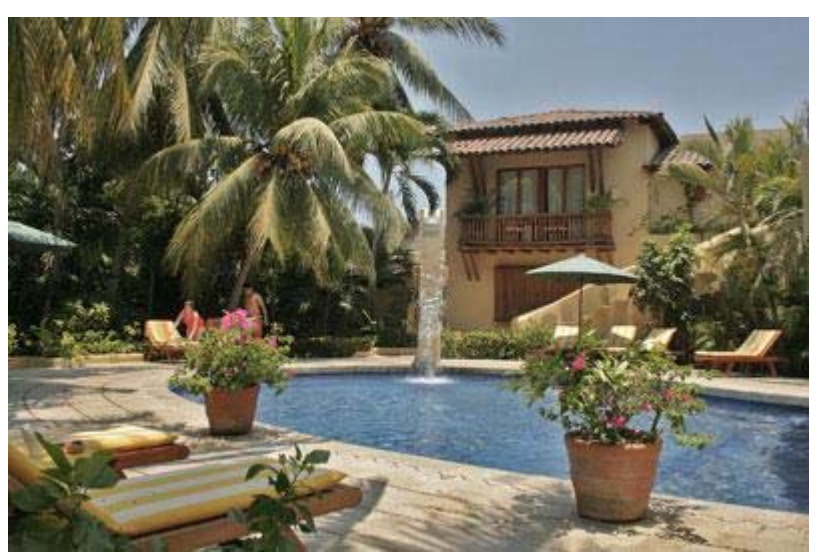
The Waterfall Pool and casitas at Villa Del Sol, Zihuatanejo, Mex.