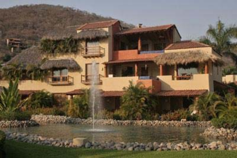
Tropical gardens and a curved staircase lead to a Garden Suite, Villa Del Sol, Zihuatanejo, Mex.