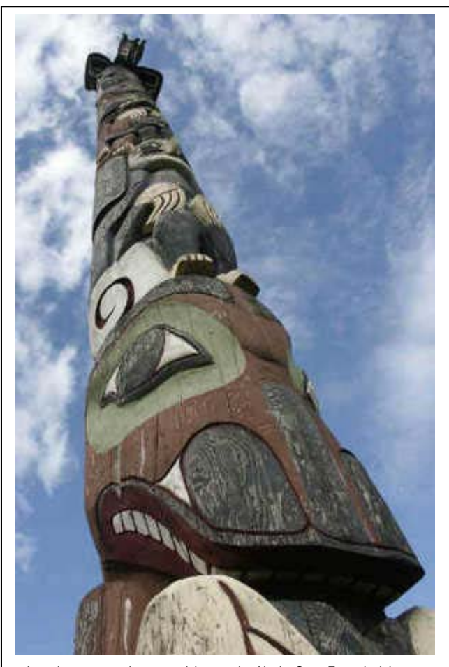
A modern totem pole greets visitors at the Alaska State Ferry dock in Prince Rupert, British Columbia.

"It won't benefit anybody — us or the tourists — to try to be like everyone else," he said. "We want to avoid Alaska's mistakes."