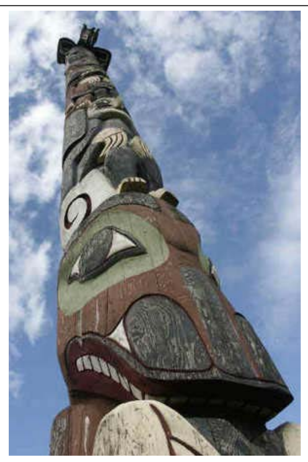
A modern totem pole greets visitors at the Alaska State Ferry dock in Prince Rupert, British Columbia.