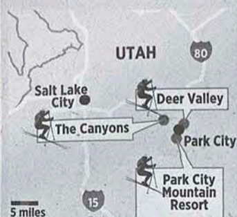
THE MIAMI HERALD

● Park City Convention and Visitors Bureau: 800-453-1360, www.parkcityinfo.com . ● Salt Lake Convention and Visitors Bureau: 800-541-4955, www.ski-saltlake.com .