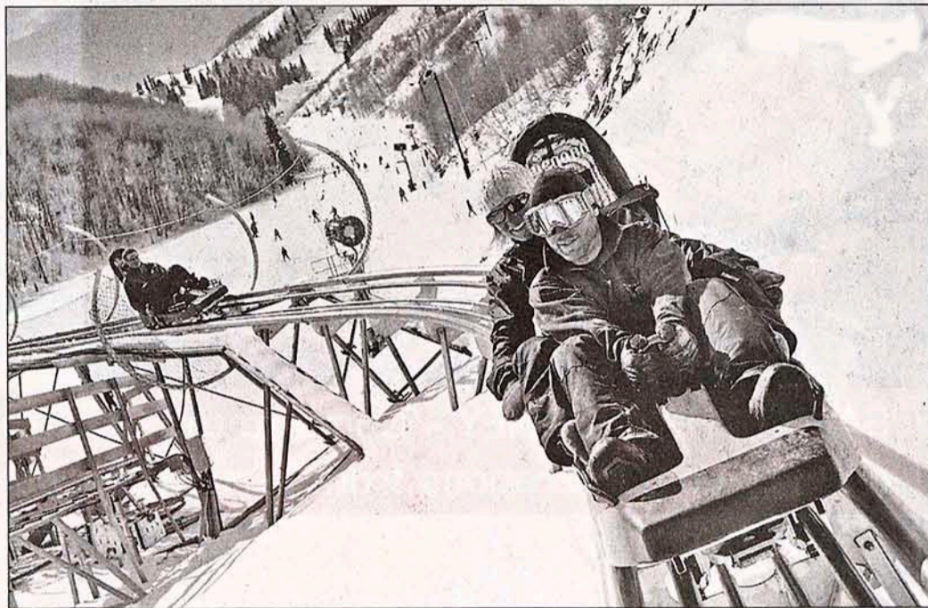
PARK CITY MOUNTAIN RESORT AND WIEGAND SPORTS

UTAH'S SLOPES: The Alpine Coaster at Park City Mountain Resort rockets down around hairpin curves at avalanche speed, above. At left, a view of Silver Lake Village from the Sterling Express chairlift at Deer Valley.