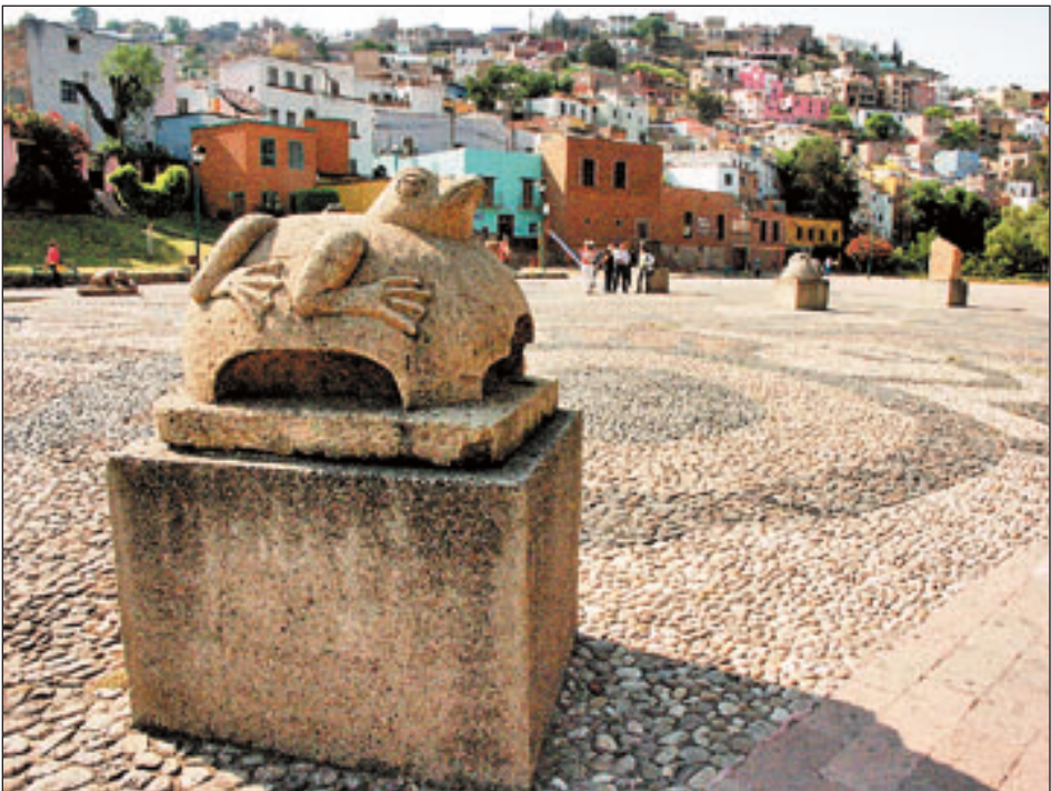
Frog statues honor Guanajuato's ancient name, "place of the frogs."

Then there was the bearded tourist in rumpled shorts and sandals, cameras dangling. You'd recognize him anywhere. But what you won't see in Guanajuato, a colonial city folded into a steep mountain val-