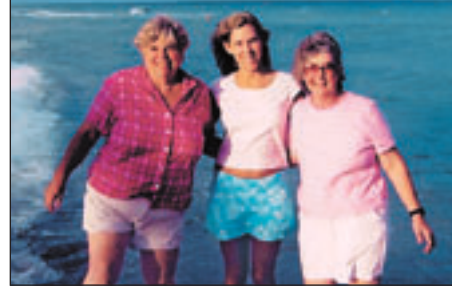
CARIBBEAN CRUISE WAS A TRULY FINE EXPERIENCE. / Where I've Been, D16