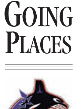
It's hockey night in Vancouver

Vancouver-bound hockey fans can score hard-to-come-by Canucks tickets with the Canucks Hockey Package at the Comfort Inn Downtown, priced at $159 per person (based on double occupancy, taxes extra) for one night's lodging, the hockey ticket, parking and continental breakfast. The season lasts through April 15. Information: (888) 605-5333; www.comfortinndowntown.com. — Chicago Tribune