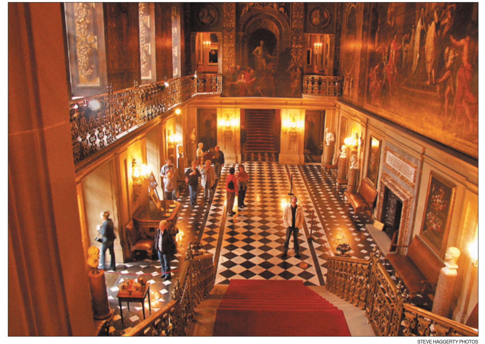
Chatsworth House in Derbyshire, England, served as Pemberley, Mr. Darcy's ancestral home. This is the Painted Hall.